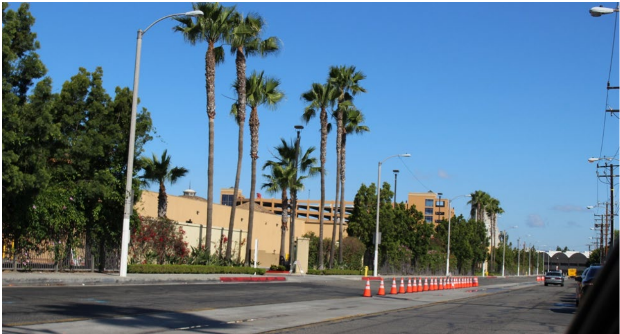
Figure 15 Viewpoint 14: Smithway Street Behind Citadel Outlets (Looking northwest)