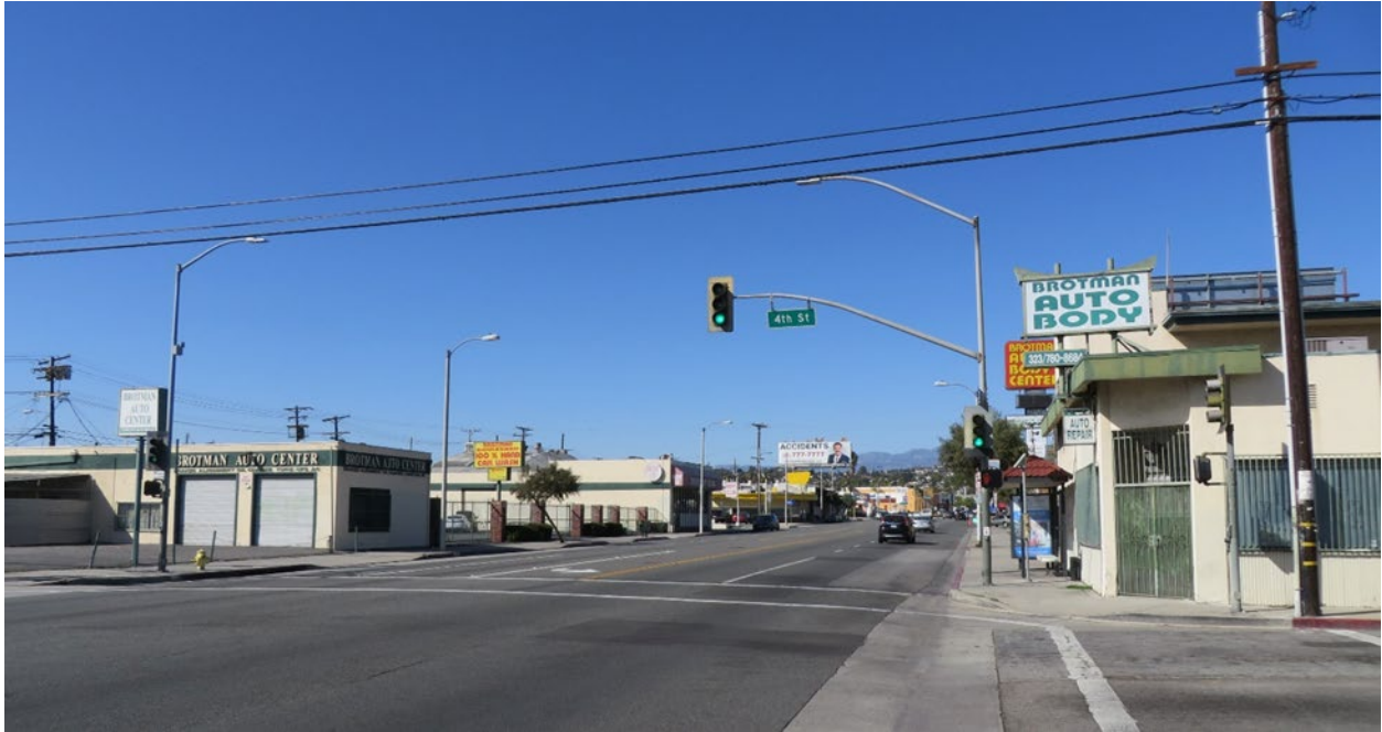
Figure 8 Viewpoint 7: Atlantic Boulevard at 4th Street (Looking north)