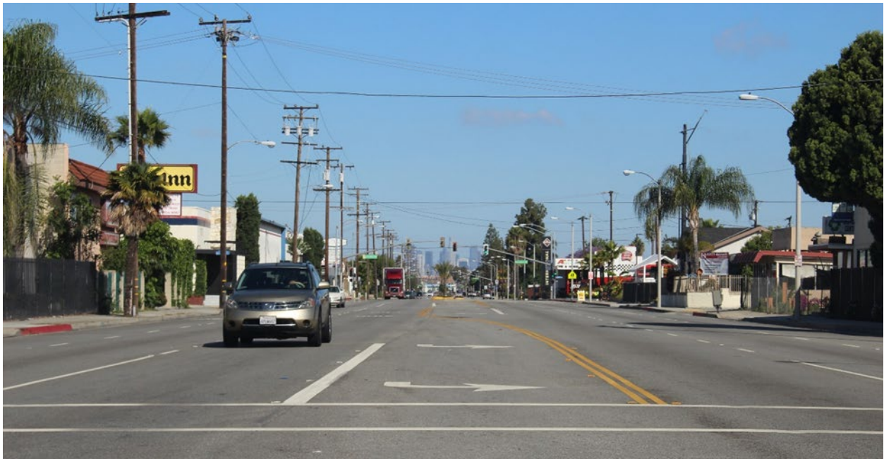
Figure 25 Viewpoint 24: Washington Boulevard at Montebello Boulevard (Looking west)