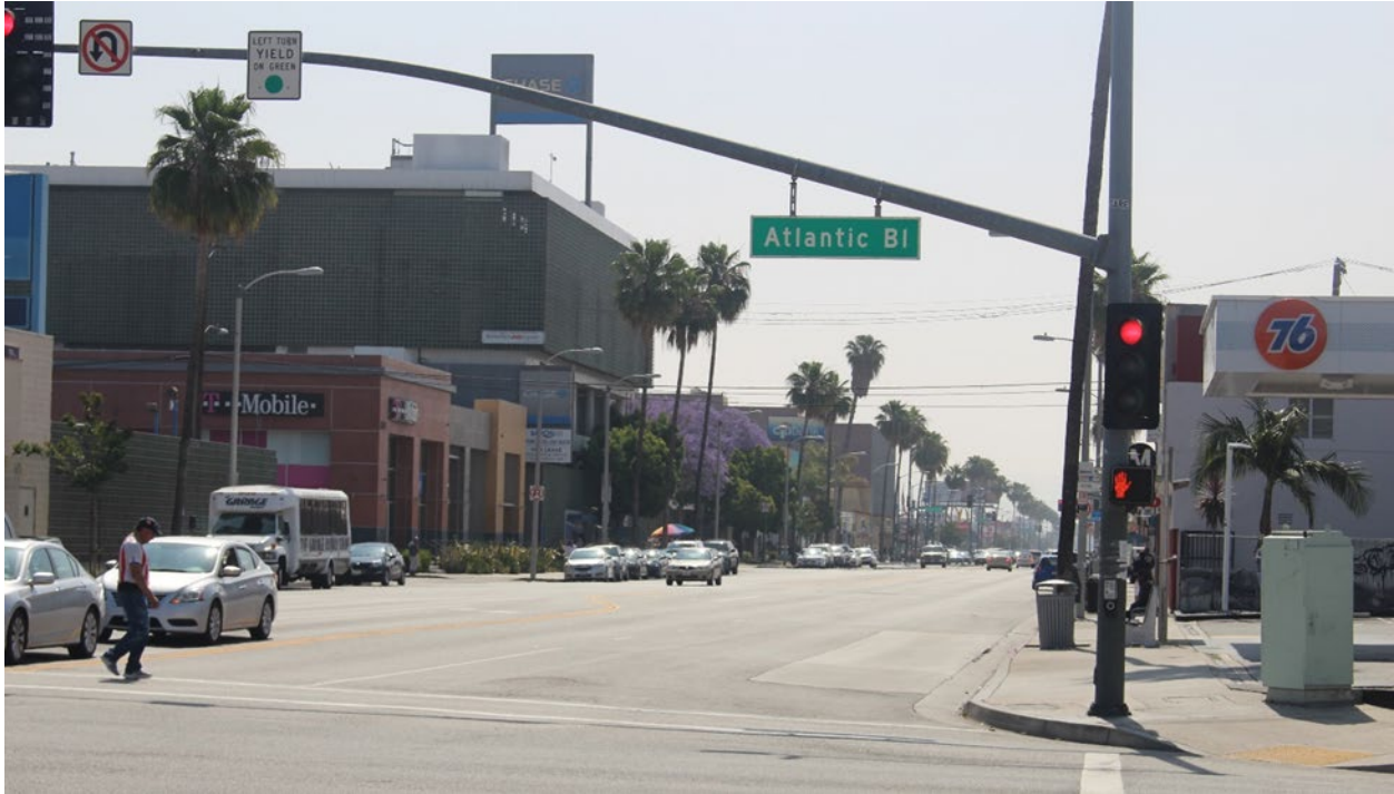
Figure 10 Viewpoint 9: Whittier Boulevard at Atlantic Boulevard (Looking east)