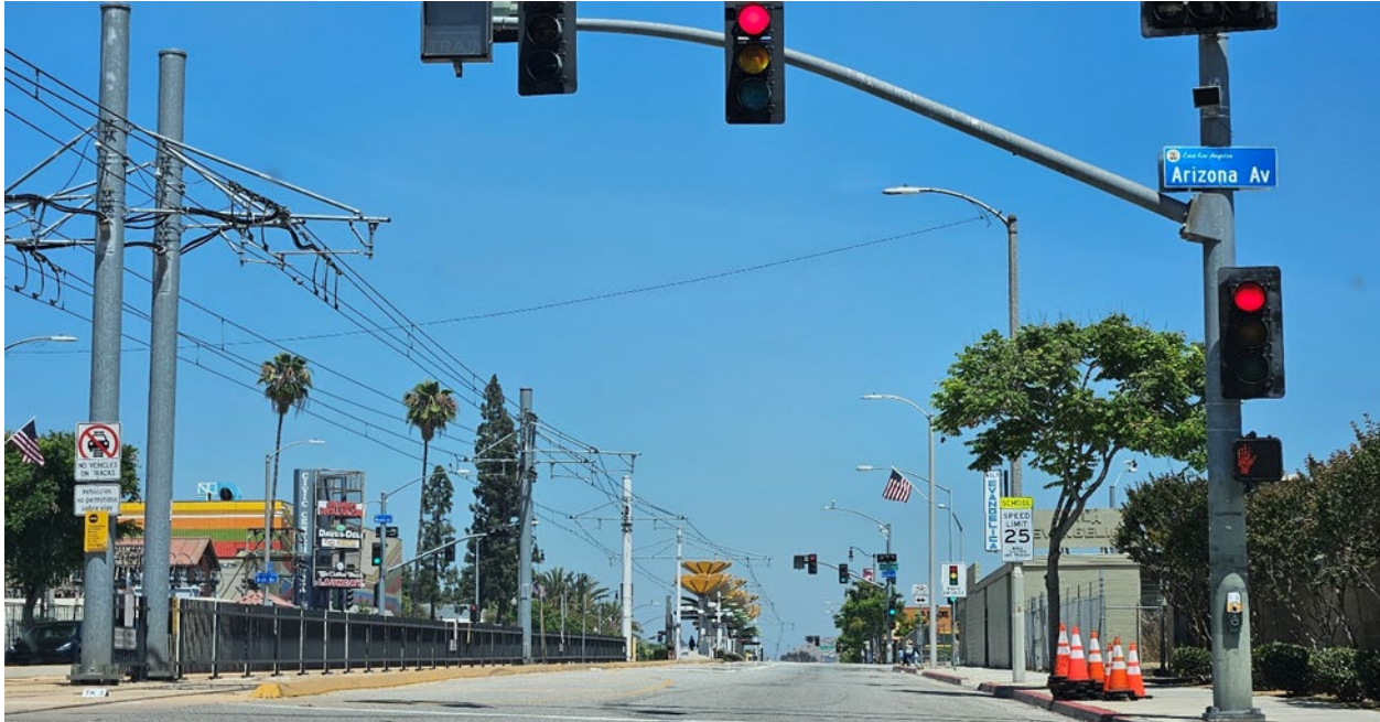
Figure 2 Viewpoint 1: Metro East Los Angeles Civic Center Station in the Background (Looking east from 3rd Street and Arizona Avenue intersection)