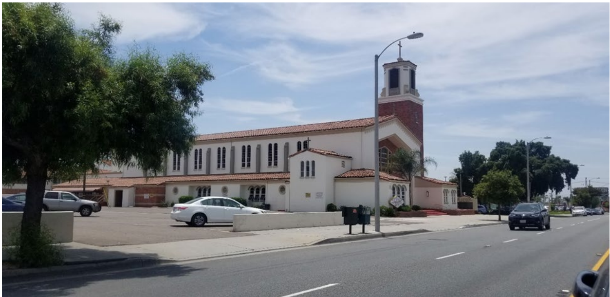
Figure 9 Viewpoint 8: Saint Alphonse Catholic Church (Looking south)