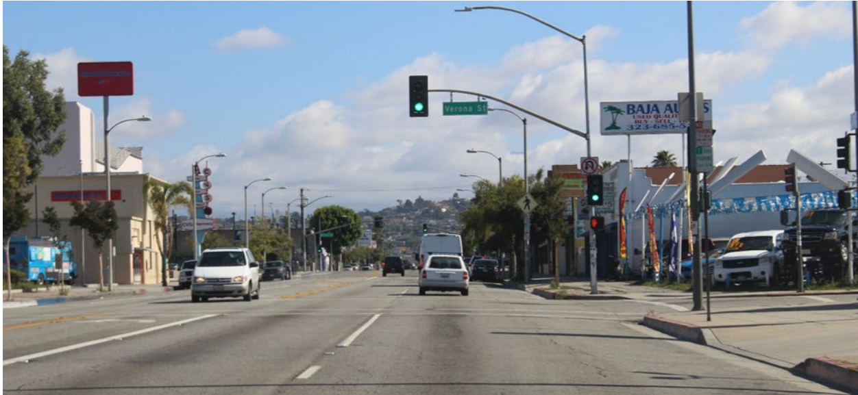
Figure 12 Viewpoint 11: Atlantic Boulevard at Verona Street (Looking north)