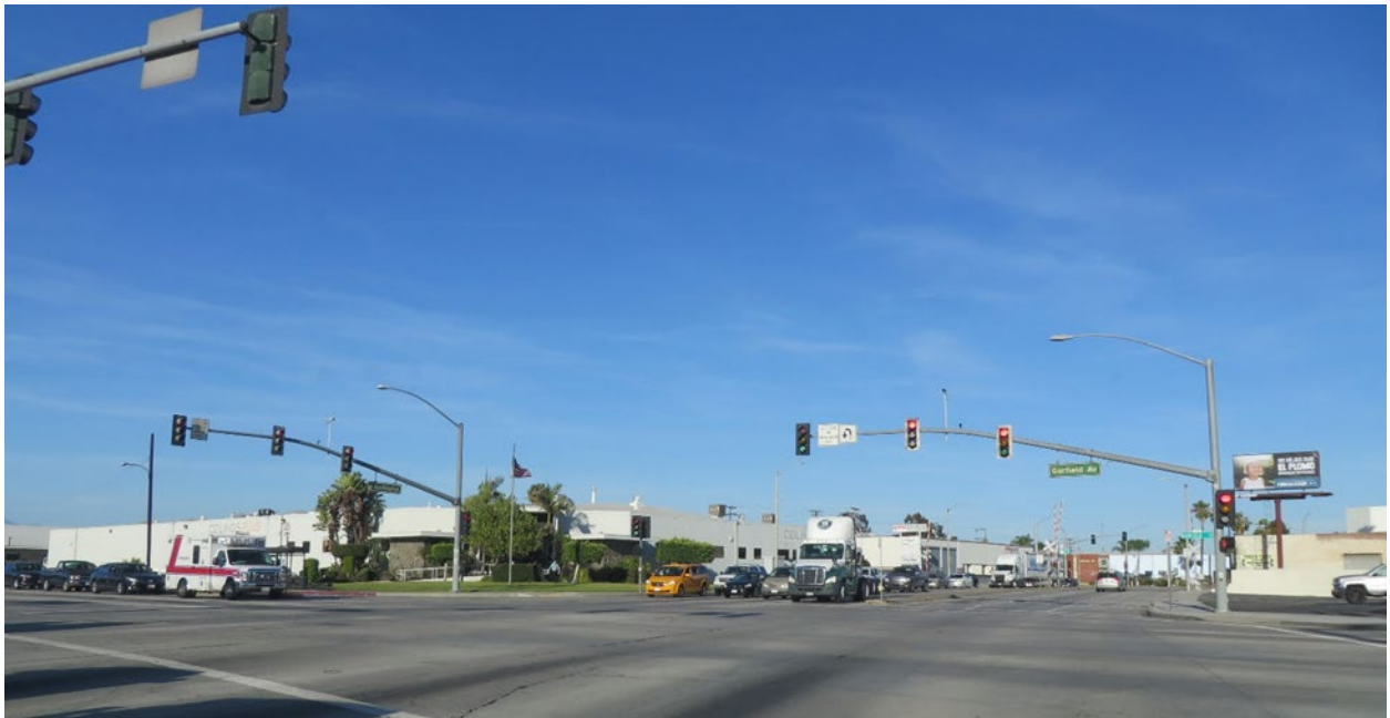
Figure 21 Viewpoint 20: Washington Boulevard at Garfield Avenue (Looking east)