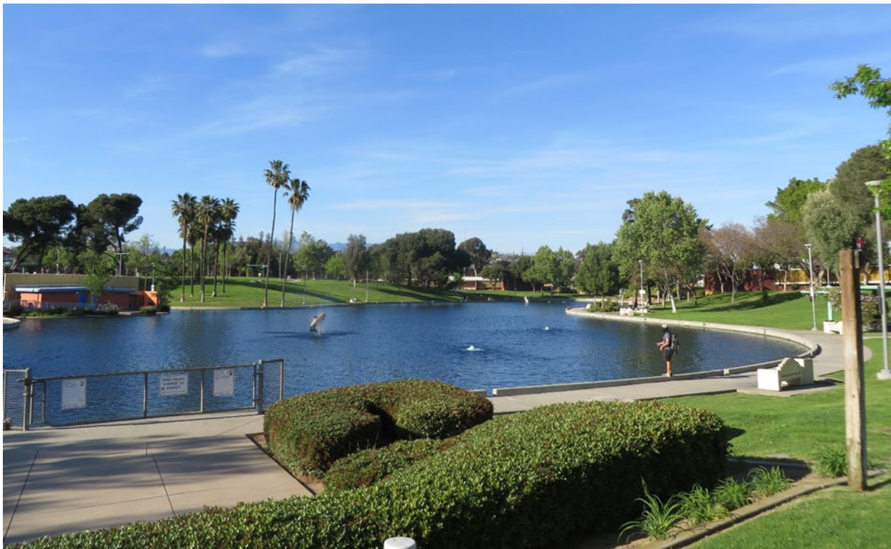
Figure 3 Viewpoint 2: Belvedere Park Lake (Looking north from within the Park)