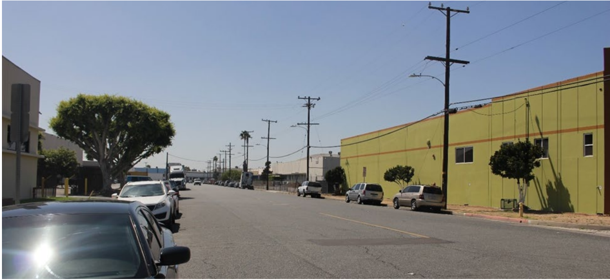
Figure 18 Viewpoint 17: Davies Avenue at Corvette Street (Looking south)