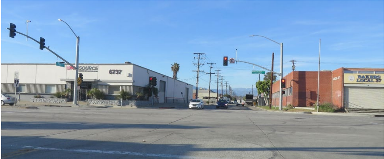
Figure 22 Viewpoint 21: Yates Avenue at Washington Boulevard (Looking north)