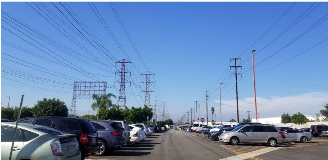
Figure 17 Viewpoint 16: Private Employee Parking within Southern California Edison Right-of-Way (Looking north)