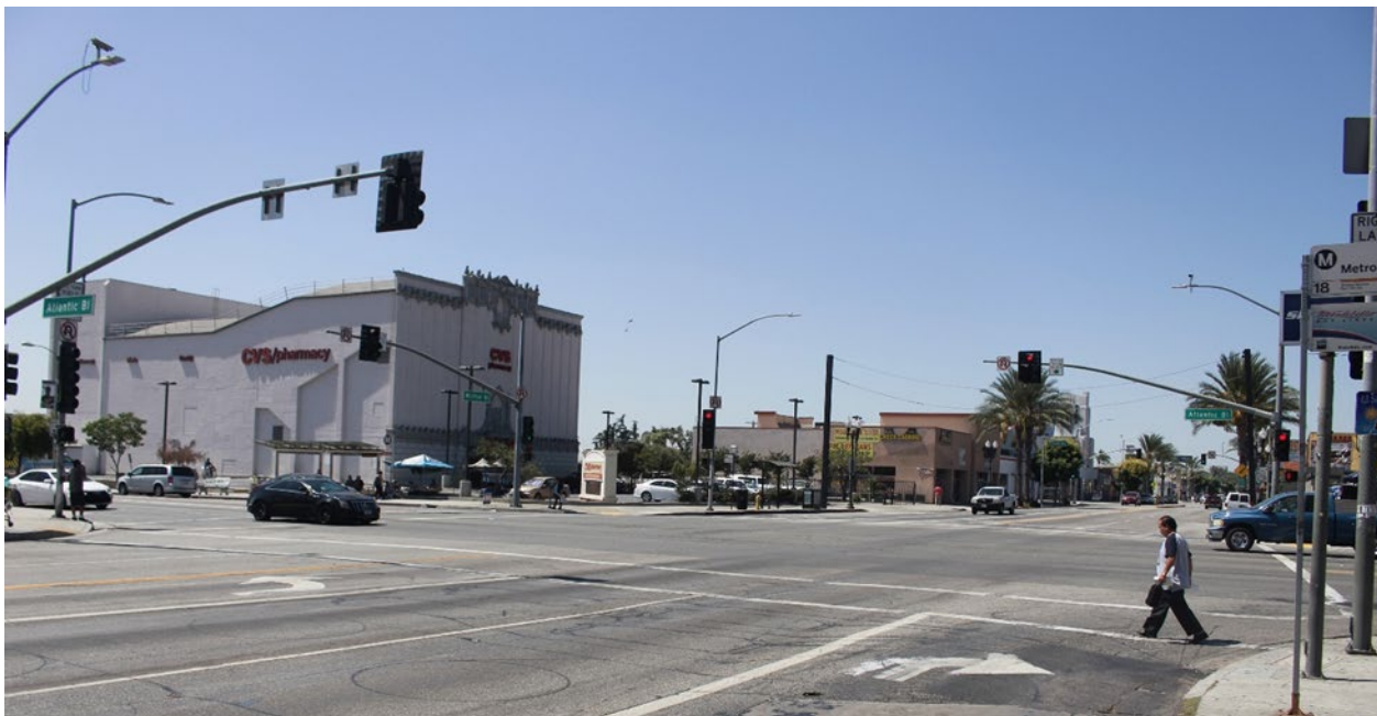
Figure 11 Viewpoint 10: Golden Gate Theater (CVS Pharmacy) (Looking west from Atlantic Boulevard and Whittier Boulevard intersection)