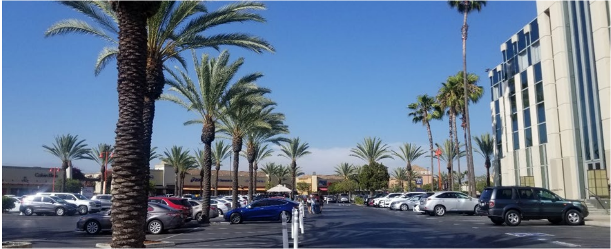
Figure 14 Viewpoint 13: Citadel Outlets (Looking north from Citadel Drive)