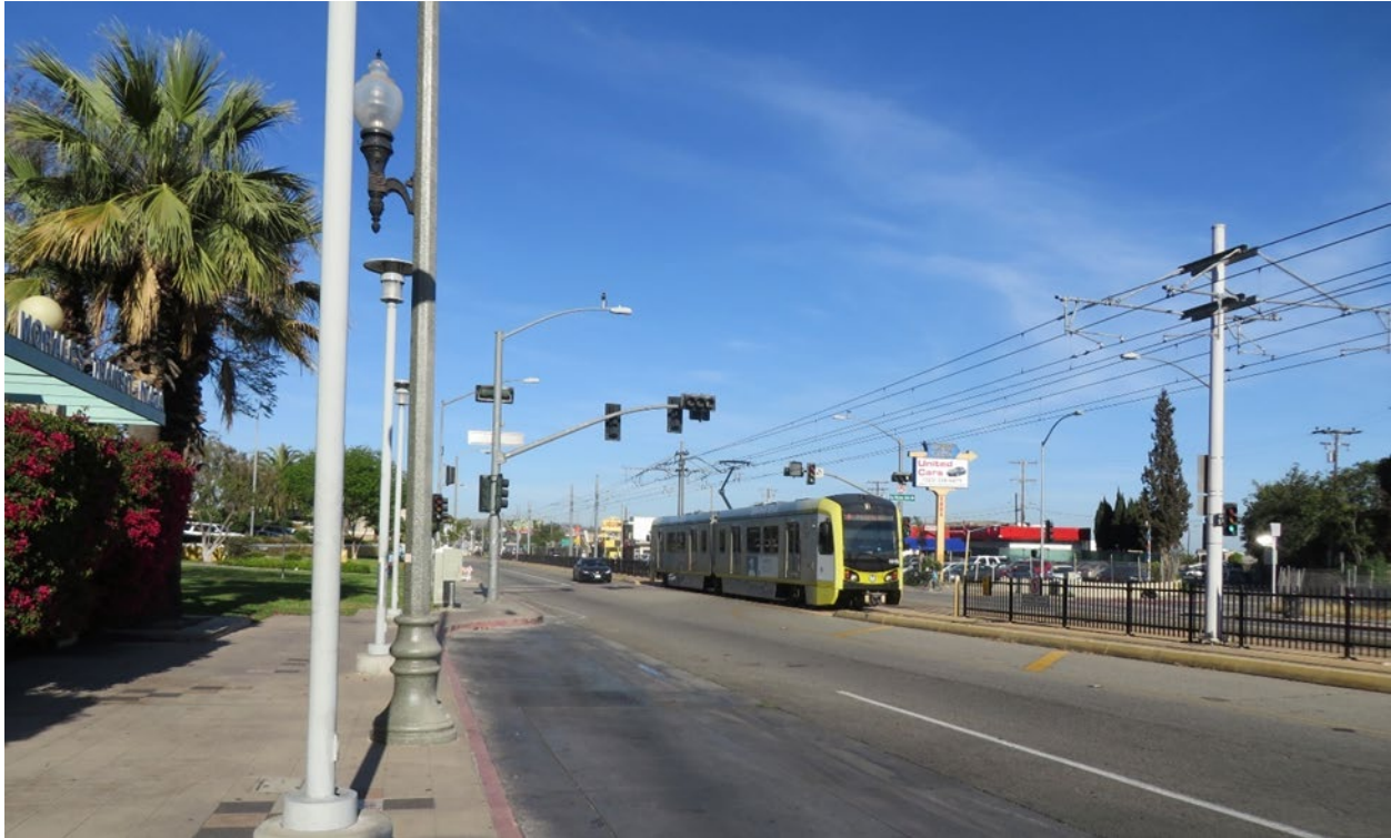
Figure 4 Viewpoint 3: Metro Light Rail Vehicle in the Foreground (Looking east from 3rd Street at East Los Angeles Civic Center)