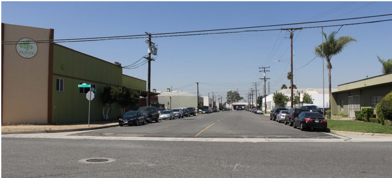
Figure 19 Viewpoint 18: Corvette Street at Davies Avenue (Looking west)