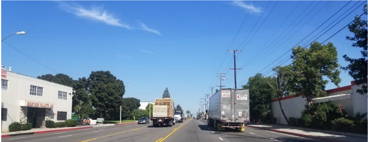
Figure 24 Viewpoint 23: Washington Boulevard at Maple Avenue (Looking east)