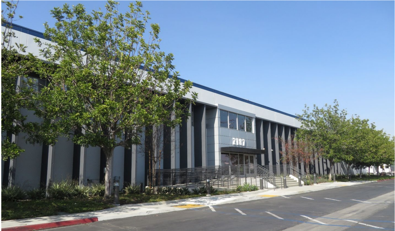
Figure 20 Viewpoint 19: Pacific Metals Company Building constructed 1955 (Looking north)