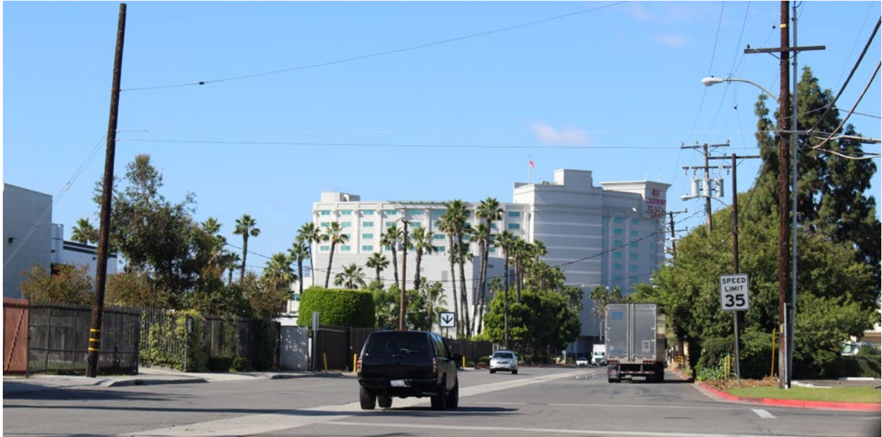
Figure 16 Viewpoint 15: Commerce Casino and Hotel (Looking south from Tubeway Avenue at Smithway Street)