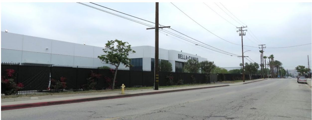
Figure 23 Viewpoint 22: Vail Avenue North of Acco Street (Looking northwest)