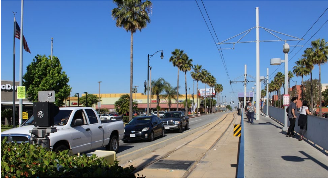
Figure 6 Viewpoint 5: Metro Atlantic Station at Pomona Boulevard (Looking west from Pomona Boulevard and Atlantic Boulevard intersection)