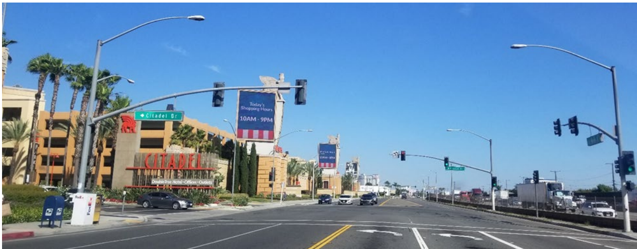
Figure 13 Viewpoint 12: Citadel Outlets Main Entrance (Looking southeast from Telegraph Road and Citadel Drive intersection)