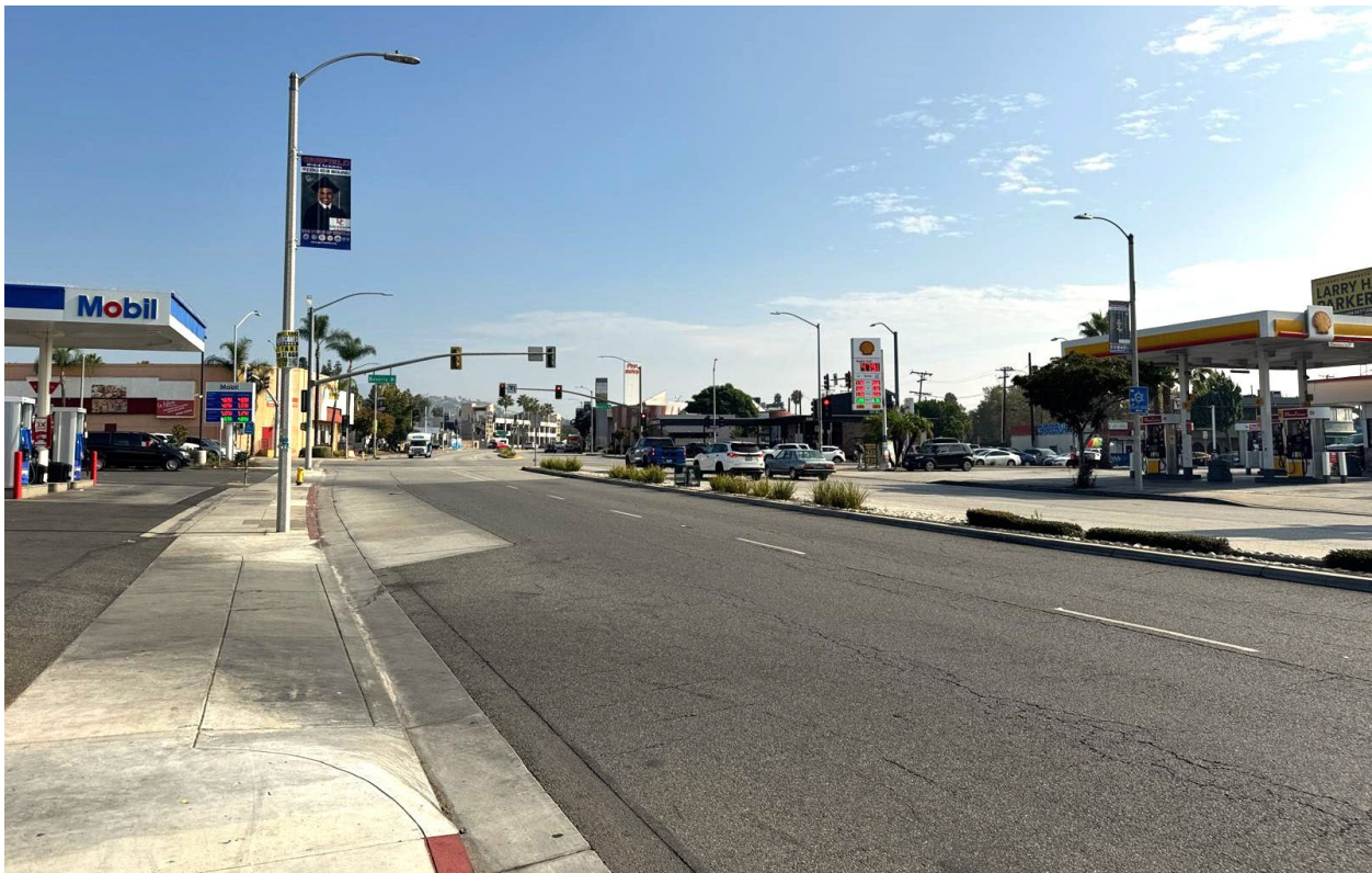
Figure 7 Viewpoint 6: Atlantic Boulevard at Beverly Boulevard (Looking north)