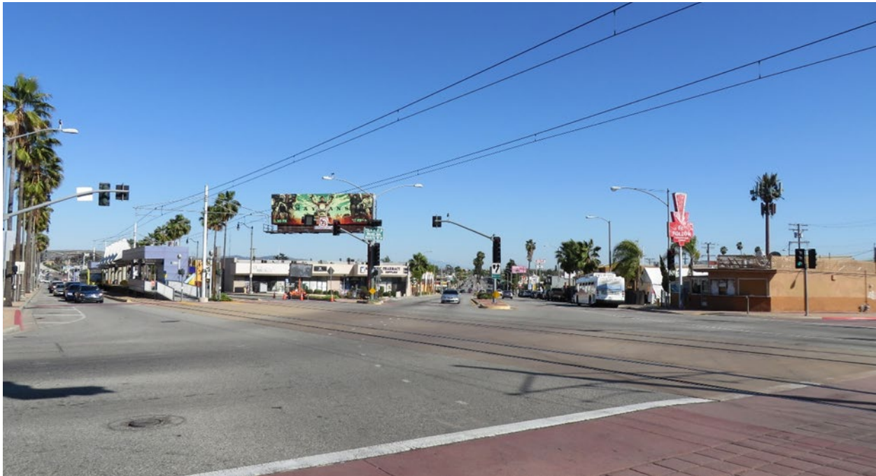
Figure 5 Viewpoint 4: Metro Atlantic Station and Beverly Boulevard in the Foreground (Looking southeast from 3rd Street and Woods Avenue intersection)