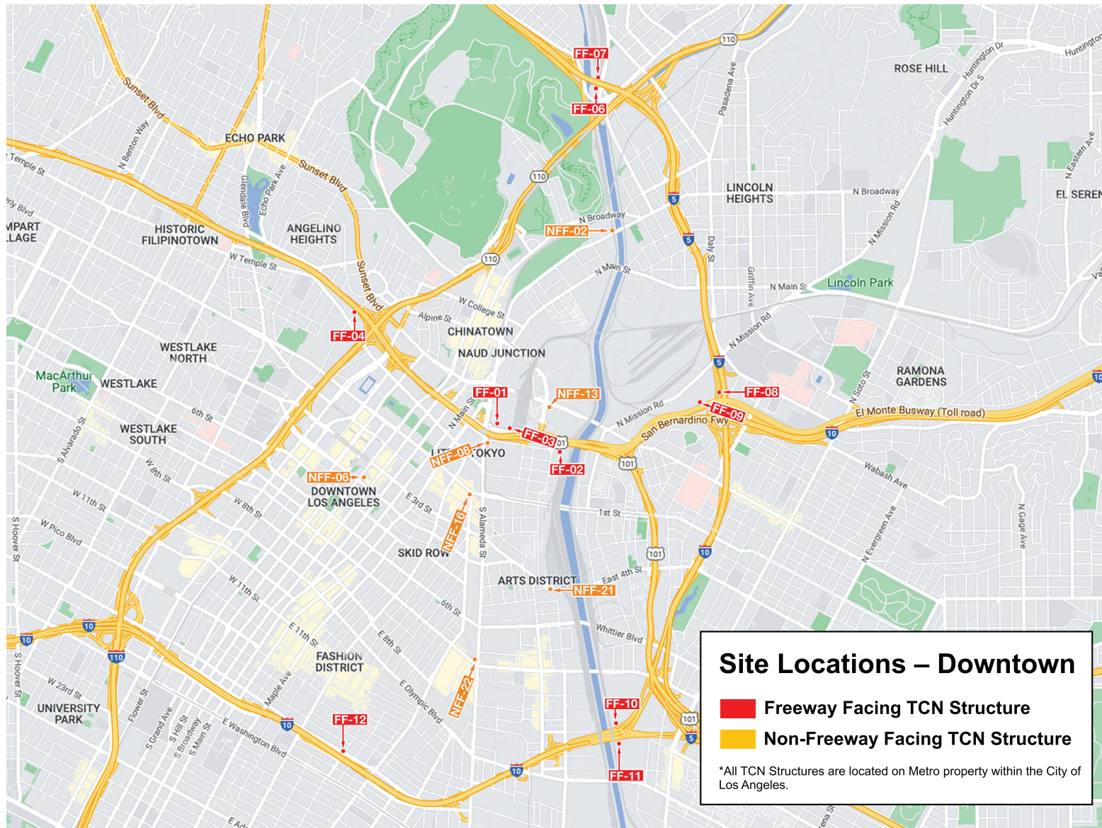
Figure 3 Regional Project Location Map – Downtown