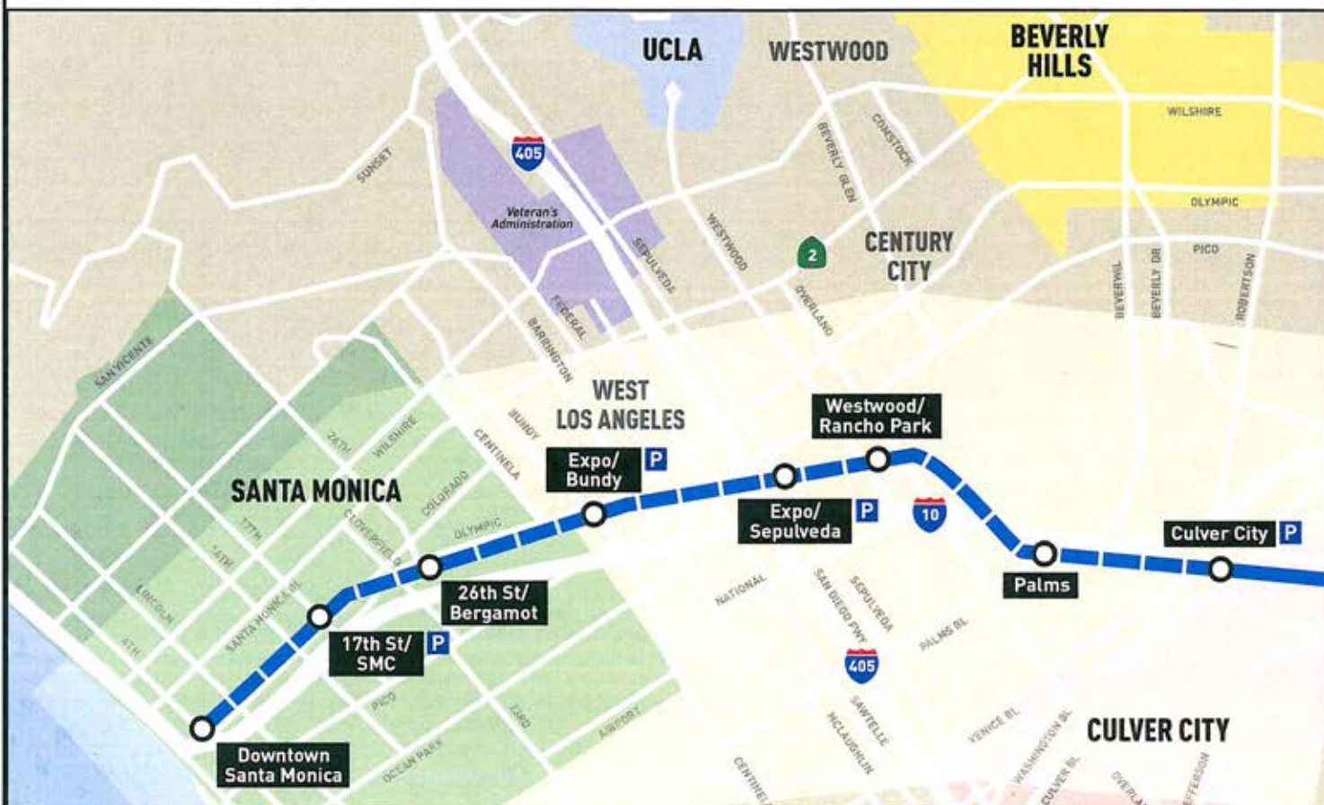
Figure 1: Exposition Metro Line Construction Authority Phase 2 Alignment

The Expo Phase 2 Project is located in the Westside of Los Angeles, extending approximately seven miles from the Expo Phase 1 terminus at Culver City Station to Santa Monica. The Phase 2 alignment begins at the terminus of Expo Phase 1 and utilizes the existing Exposition Right-of-Way (ROW), then diverges from the Exposition ROW and enters onto Colorado Avenue east of 17 th Street. The alignment follows the center of Colorado Avenue to the proposed terminus in downtown Santa Monica in the vicinity of the intersection of 4 th Street and Colorado Avenue.