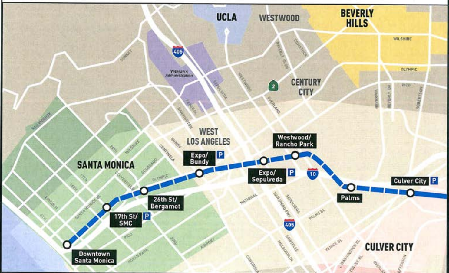
Figure 1: Exposition Metro Line Construction Authority Phase 2 Alignment

The Expo Phase 2 Project is located in the Westside of Los Angeles, extending approximately seven miles from the Expo Phase 1 terminus at Culver City Station to Santa Monica. The Phase 2 alignment begins at the terminus of Expo Phase 1 and utilizes the existing Exposition Right-of-Way (ROW), then diverges from the Exposition ROW and enters onto Colorado Avenue east of 17 th Street. The alignment follows the center of Colorado Avenue to the proposed terminus in downtown Santa Monica in the vicinity of the intersection of 4 th Street and Colorado Avenue.