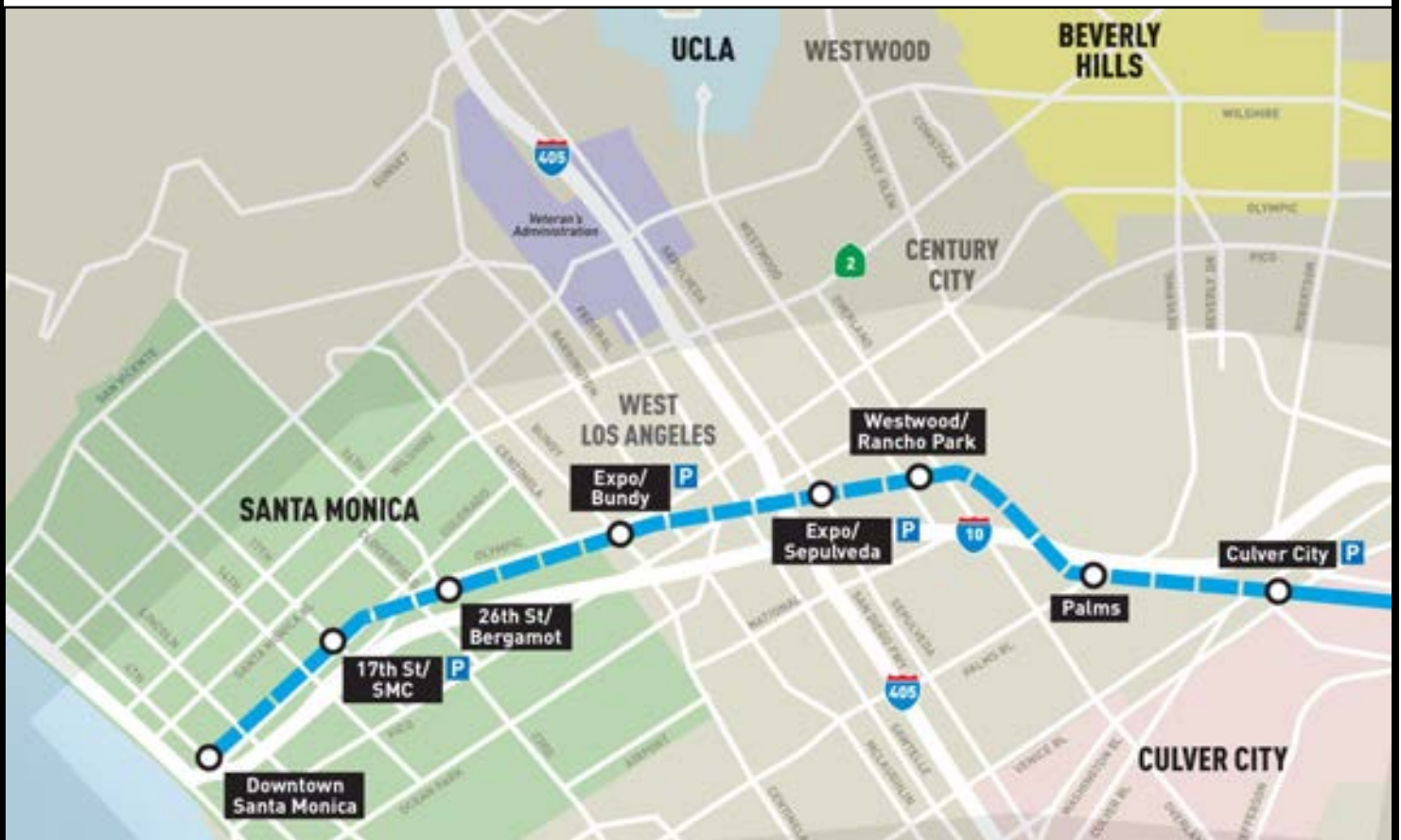
Figure 1: Exposition Metro Line Construction Authority Phase 2 Alignment

The Expo Phase 2 Project is located in the Westside of Los Angeles, extending approximately seven miles from the Expo Phase 1 terminus at Culver City Station to Santa Monica. The Phase 2 alignment begins at the terminus of Expo Phase 1 and utilizes the existing Exposition Right-of-Way (ROW), then diverges from the Exposition ROW and enters onto Colorado Avenue east of 17 th Street. The alignment follows the center of Colorado Avenue to the proposed terminus in downtown Santa Monica in the vicinity of the intersection of 4 th Street and Colorado Avenue.