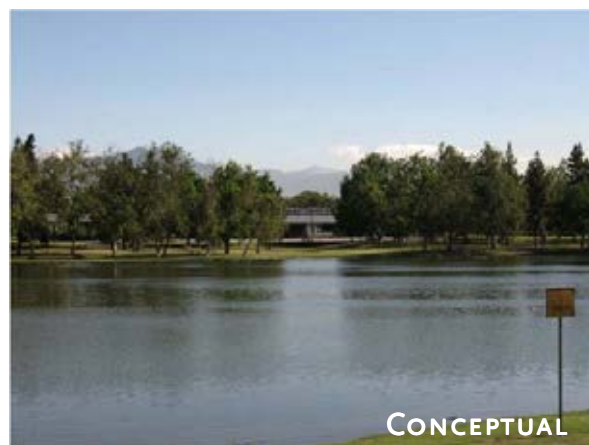
Figure 4.6-3. Visual Simulation from North Lake