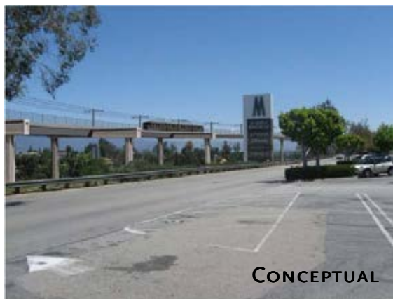
Figure 4.6-2. Visual Simulation at Montebello Town Center

In addition, through the Whittier Narrows Recreation Area, the aerial LRT would reduce motorist views of the recreation area and North Lake while creating new views for LRT riders. However,