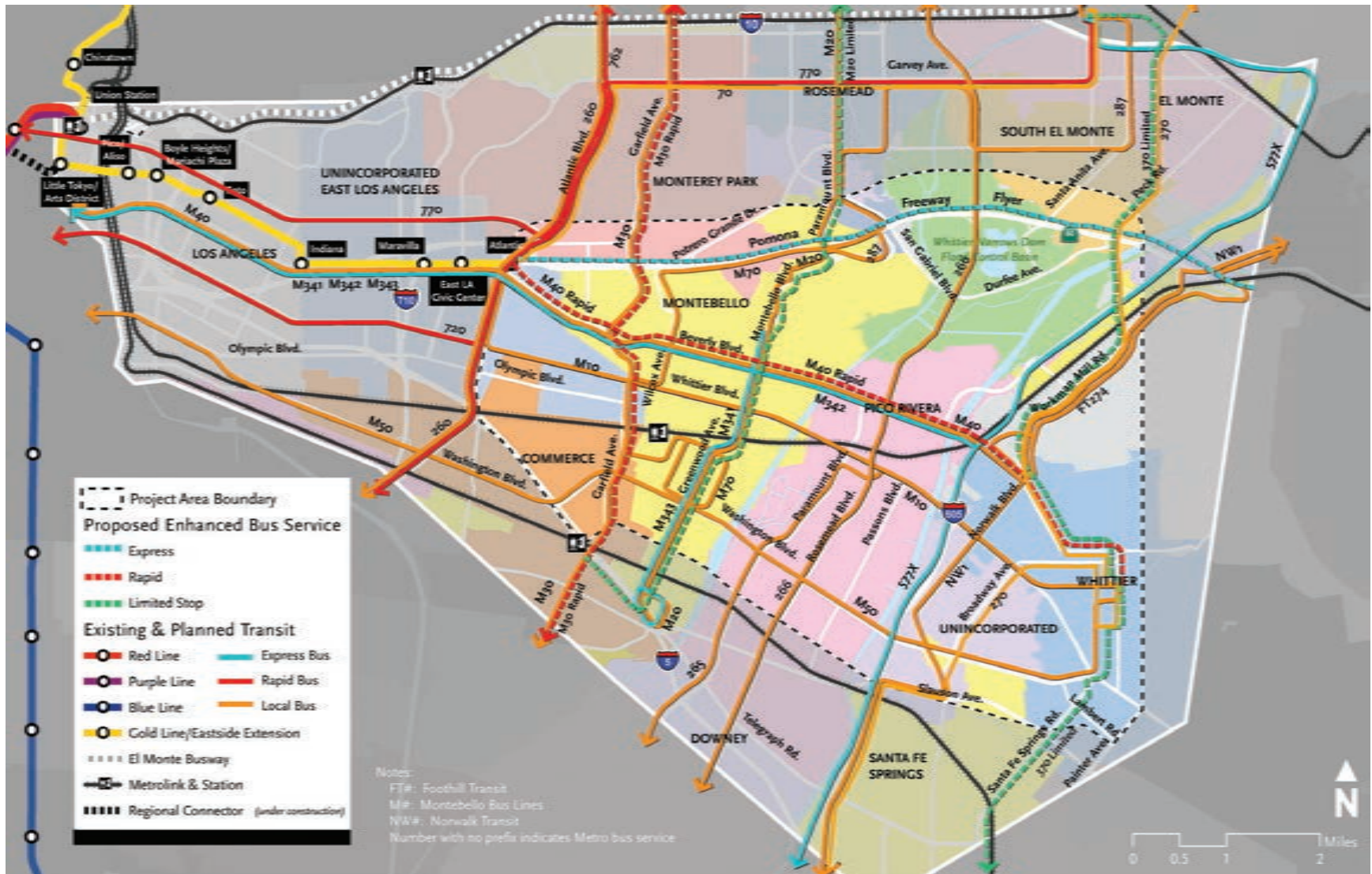
Figure ES-4: Transportation System Management Alternative