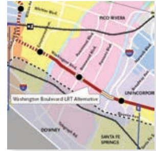
See Figure ES-5 on page ES-9

Three potential sites, as shown in Figure ES-5, have been preliminarily identified for the location of a new maintenance yard. A maintenance yard in the city of Monrovia, which is currently under construction, is also an option for the maintenance yard that would service this line. Two design variations are being considered for the Washington Boulevard LRT Alternative. The first design variation, the Rosemead Boulevard aerial crossing, would include a grade separation at Rosemead Boulevard. Compared to the original street running configuration of the Washington Boulevard LRT Alternative crossing the San Gabriel River/I-605, the second design variation would include an aerial crossing over the San Gabriel River/I-605 and a grade separation at Pioneer Boulevard.