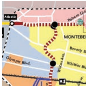
See Figure ES-5 on page ES-9