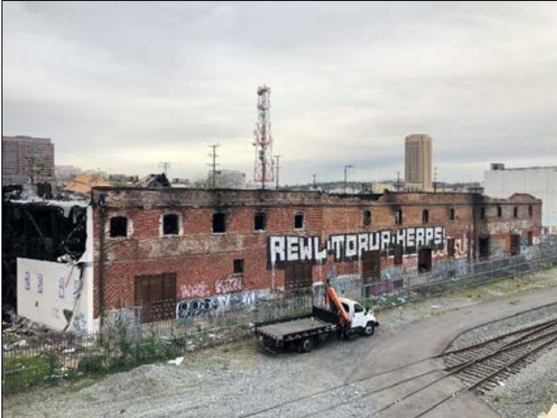
Figure 10. Citizens Warehouse/Lysle Storage Company (Pickle Works). East elevation. Looking northwest. ICF: November, 2018.