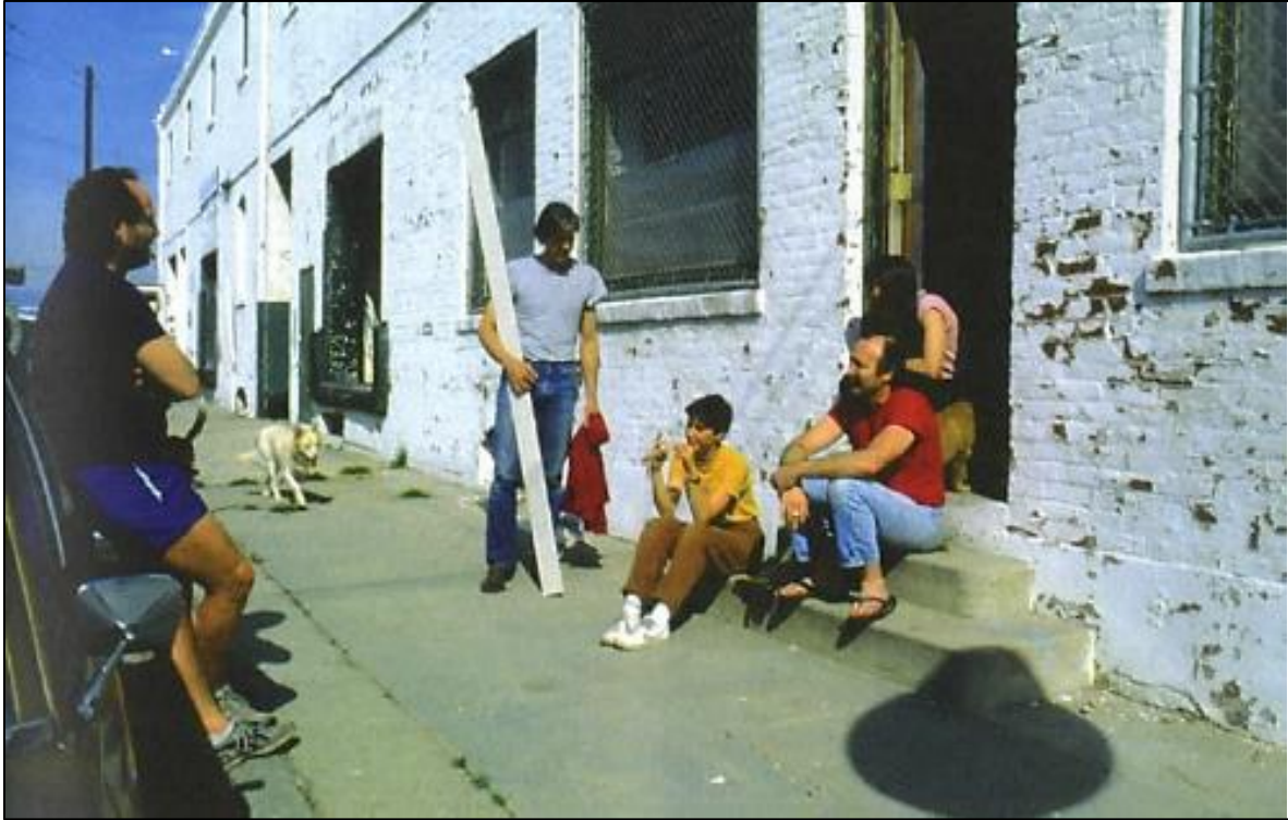
Figure 13. Artists at Citizens Warehouse c. 1981.