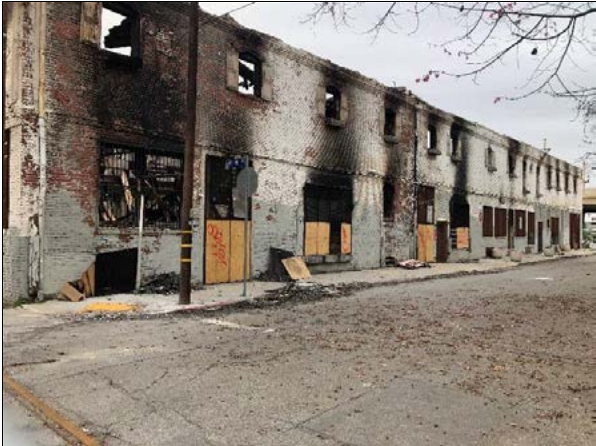
Figure 8. Citizens Warehouse/Lysle Storage Company (Pickle Works). West elevation. The former Art Dock is the last loading bay to the right with the single wood board over it. Looking southeast. ICF: November, 2018.