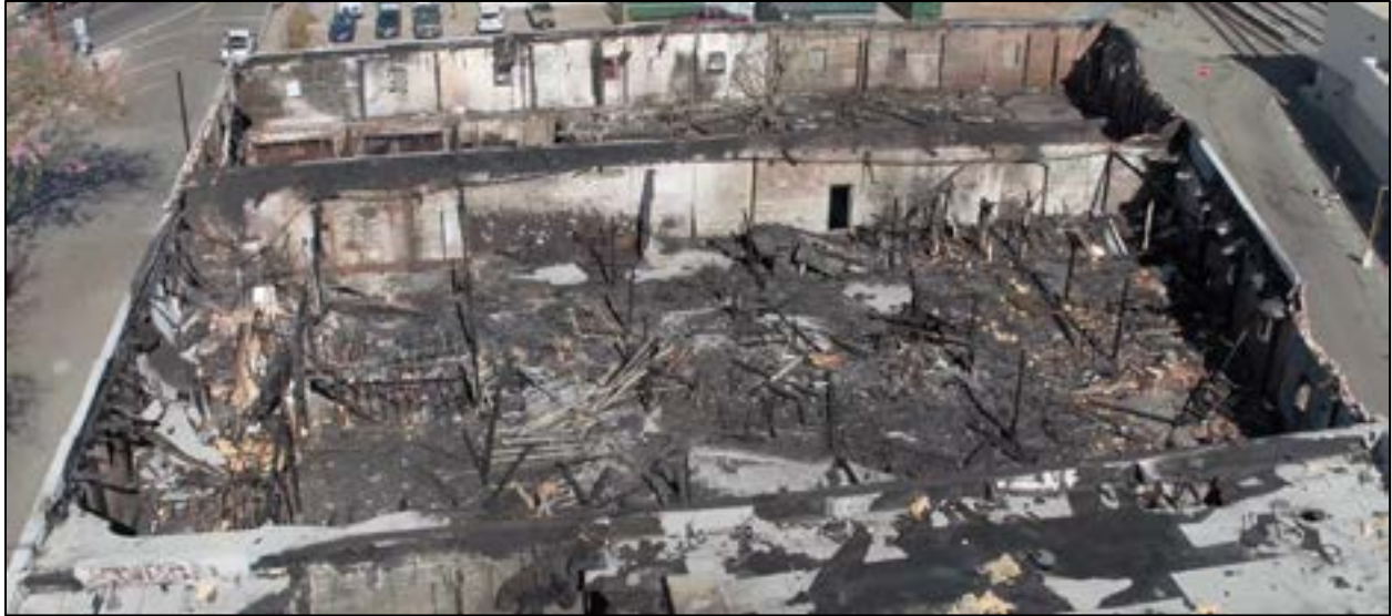
Figure 6. Citizens Warehouse/ Lysle Storage Company (Pickle Works). Drone footage of north and central portions. Looking north, northeast, and downward. Zephyr UAS: November, 2018.