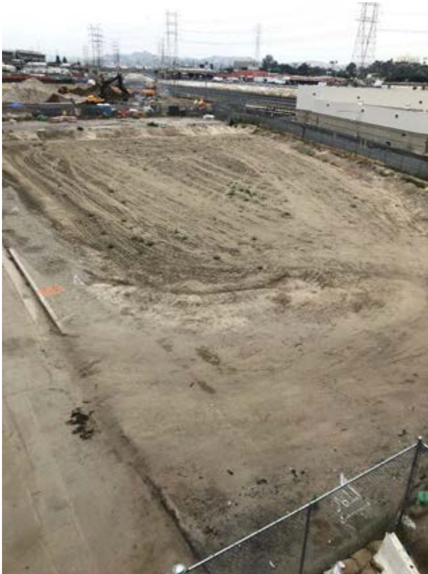
Figure 1: The former site of Citizens Warehouse/ Lysle Storage Company (Pickle Works). ICF, June 2019.