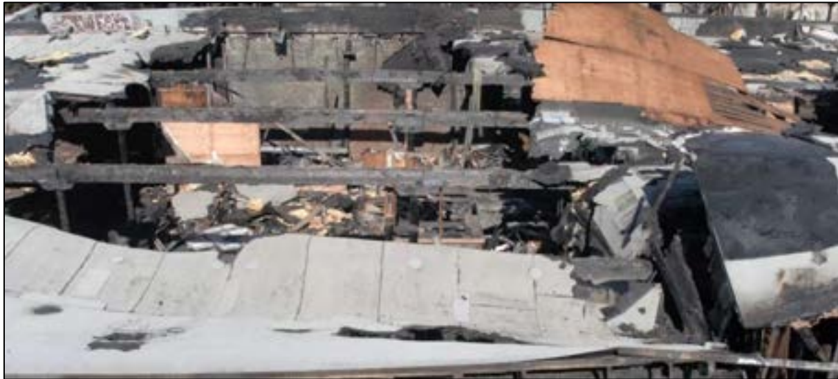
Figure 7. Citizens Warehouse/Lysle Storage Company (Pickle Works). Drone footage of southern portion. Looking north, northeast, and downward. Zephyr UAS: November, 2018.