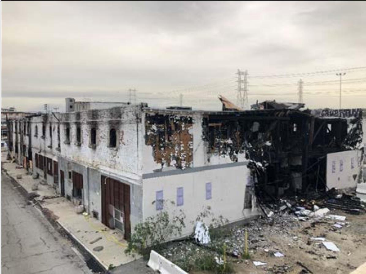
Figure 11. Citizens Warehouse/Lysle Storage Company (Pickle Works). West and south elevations. Looking northeast. ICF: November, 2018.