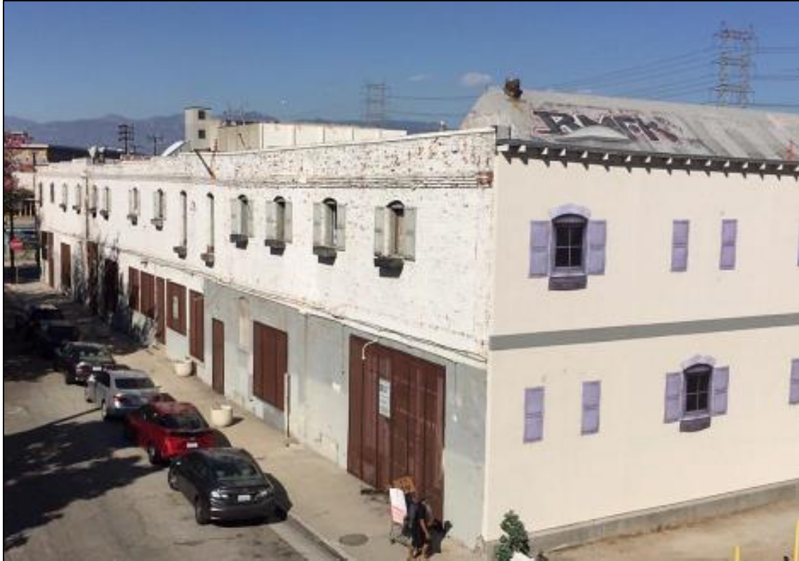
Figure 18. [Pre- Nov. 2018 Fire]: Citizens Warehouse/Lysle Storage Company, showing truncated south elevation to right of frame. View: NE. September, 2017.