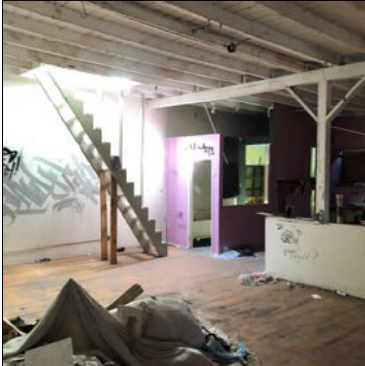
Figure 2. Interior, second level, facing SW. As an early artist loft, the combination of recent, ad-hoc elements to make spaces livable coupled with original design features of the early twentieth century building, were, taken together, a primary character-defining feature. ICF, August 2018.