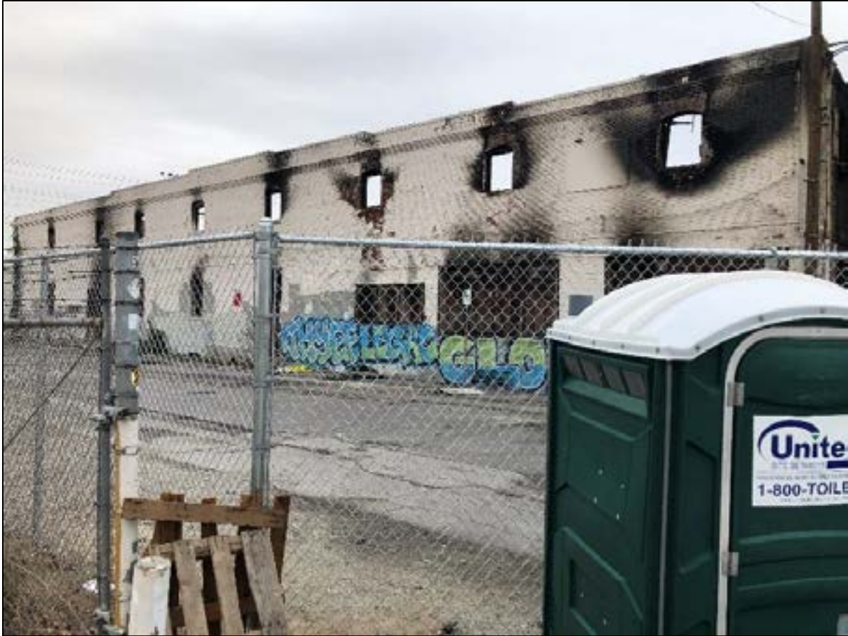
Figure 9. Citizens Warehouse/Lysle Storage Company (Pickle Works). North elevation. Looking southeast. ICF: November, 2018.