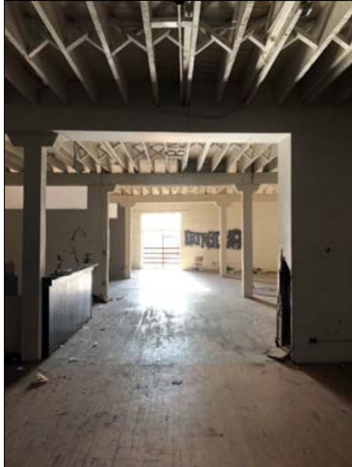
Figure 4. Interior, first level. Facing east. As an early artist loft, the combination of recent, ad-hoc elements to make spaces livable coupled with original design features of the early twentieth century building, were, taken together, a primary character defining feature. ICF, August 2018.