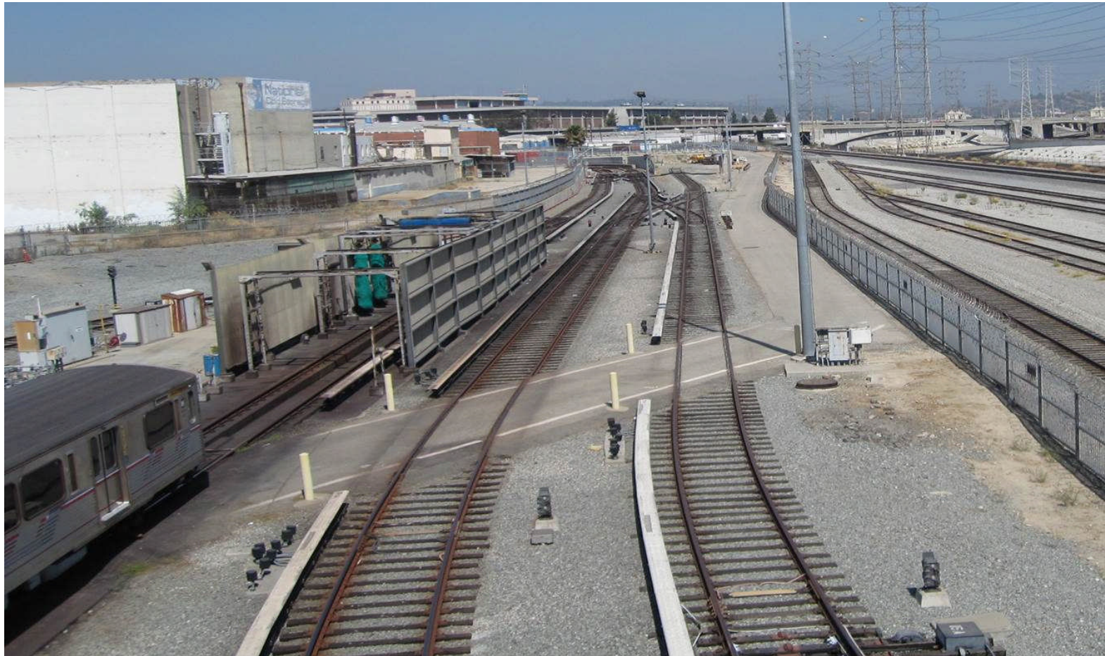
View North from 1 st Street Bridge