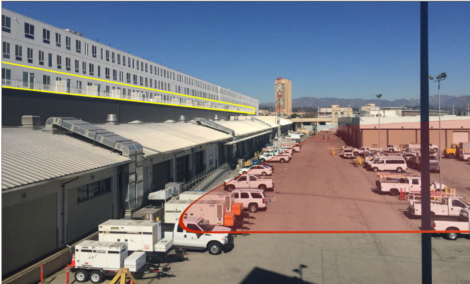
Proposed Site for Additional Tracks and Turnback Facility near 3 rd Street