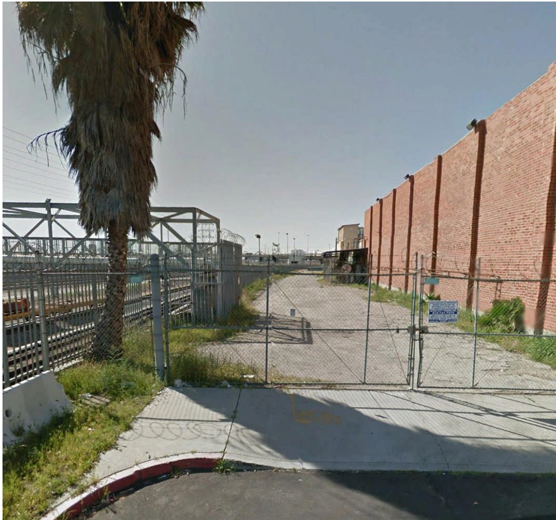
View South from Portal at Jackson Street