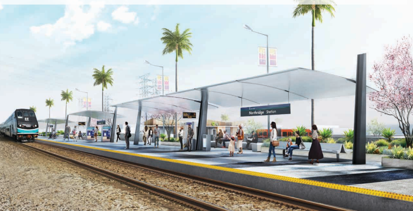
Potential Station Development