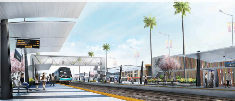
Potential Station Development with TOD