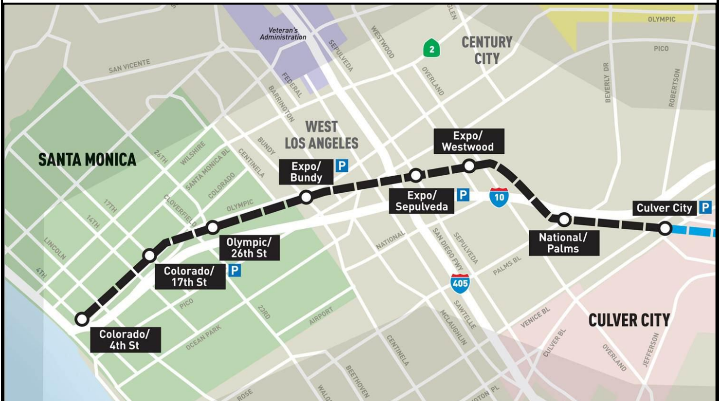
Figure 1: Exposition Metro Line Construction Authority Phase 2 Alignment

The Expo Phase 2 Project is located in the Westside of Los Angeles, extending approximately seven miles from the Expo Phase 1 terminus at Culver City Station to Santa Monica. The Phase 2 alignment begins at the terminus of Expo Phase 1 and utilizes the existing Exposition Right-of-Way (ROW), then diverges from the Exposition ROW and enters onto Colorado Avenue east of 17 th Street. The alignment follows the center of Colorado Avenue to the proposed terminus in downtown Santa Monica in the vicinity of the intersection of 4 th Street and Colorado Avenue.