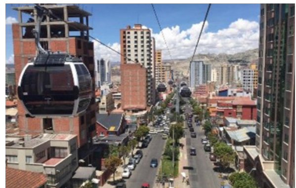
La Paz, Bolivia