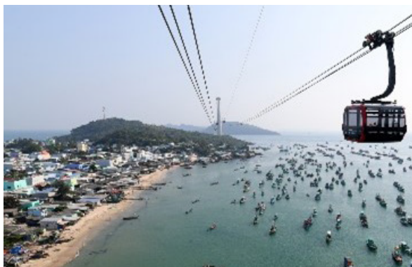
Phu Quoc, Vietnam