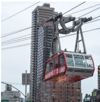
Roosevelt Island, New York