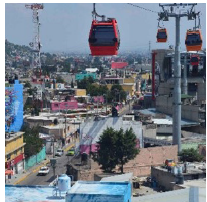
Mexico City, Mexico