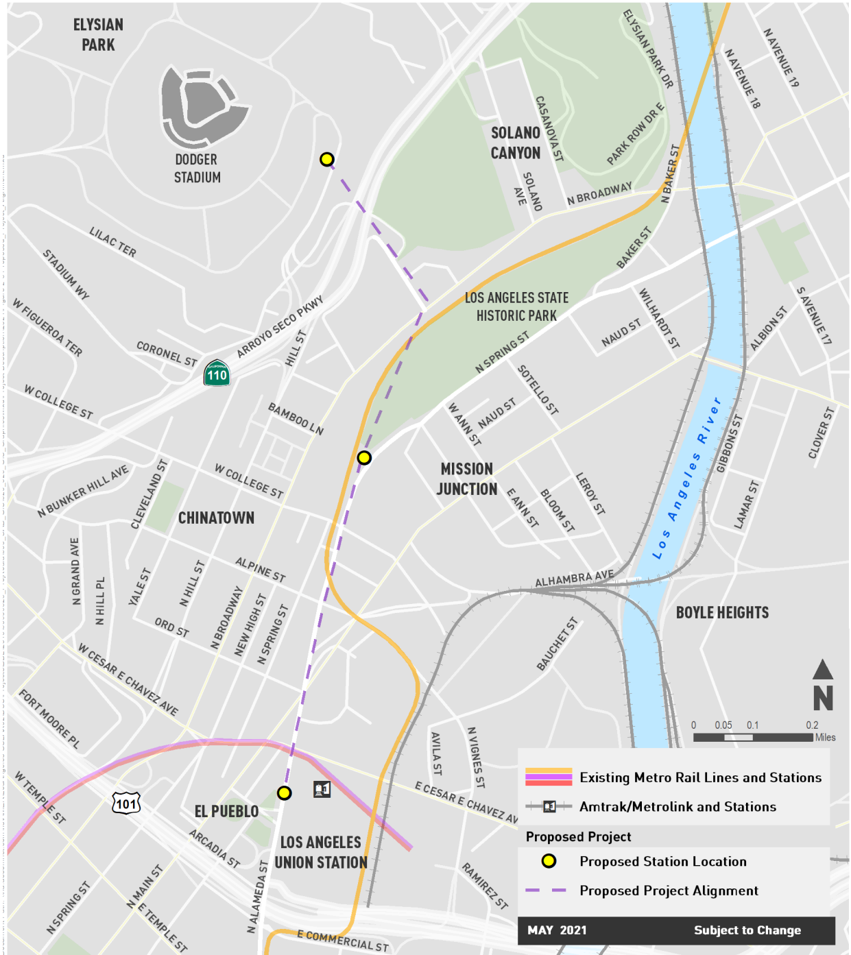
Figure ES-2: Proposed Project Location