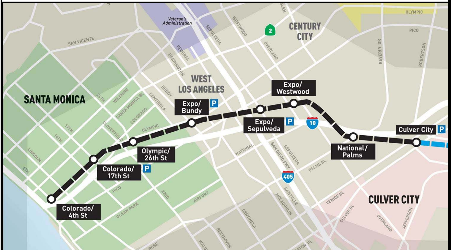
Figure 1: Exposition Metro Line Construction Authority Phase 2 Alignment

The Expo Phase 2 Project is located in the Westside of Los Angeles, extending approximately seven miles from the Expo Phase 1 terminus at Culver City Station to Santa Monica. The Phase 2 alignment begins at the terminus of Expo Phase 1 and utilizes the existing Exposition Right-of-Way (ROW), then diverges from the Exposition ROW and enters onto Colorado Avenue east of 17 th Street. The alignment follows the center of Colorado Avenue to the proposed terminus in downtown Santa Monica in the vicinity of the intersection of 4 th Street and Colorado Avenue.