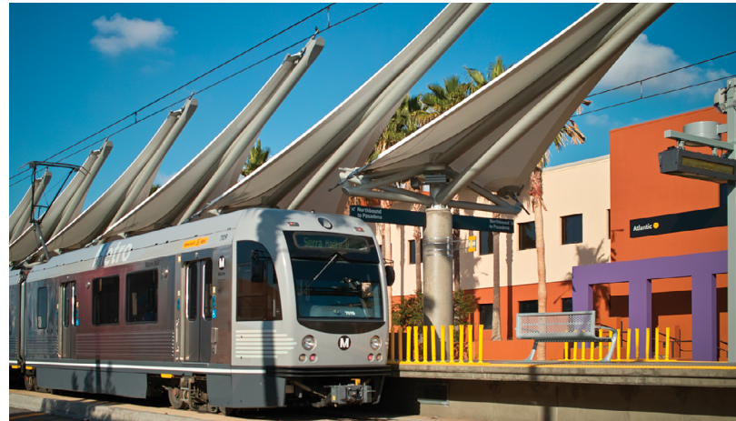
Atlantic Station: Metro Gold Line station in East LA

Following the completion of project construction, Metro will return leased properties to the property owner, who may then develop the property in accordance with local zoning regulations. In cases where Metro has obtained fee title, any portions of the property owned by Metro that are no longer needed for public purposes after construction may be sold or made available for joint development subject to local land use regulations and approval processes. If a joint development project is feasible, Metro will typically issue a Request for Proposals (RFP) seeking development proposals for the particular property.