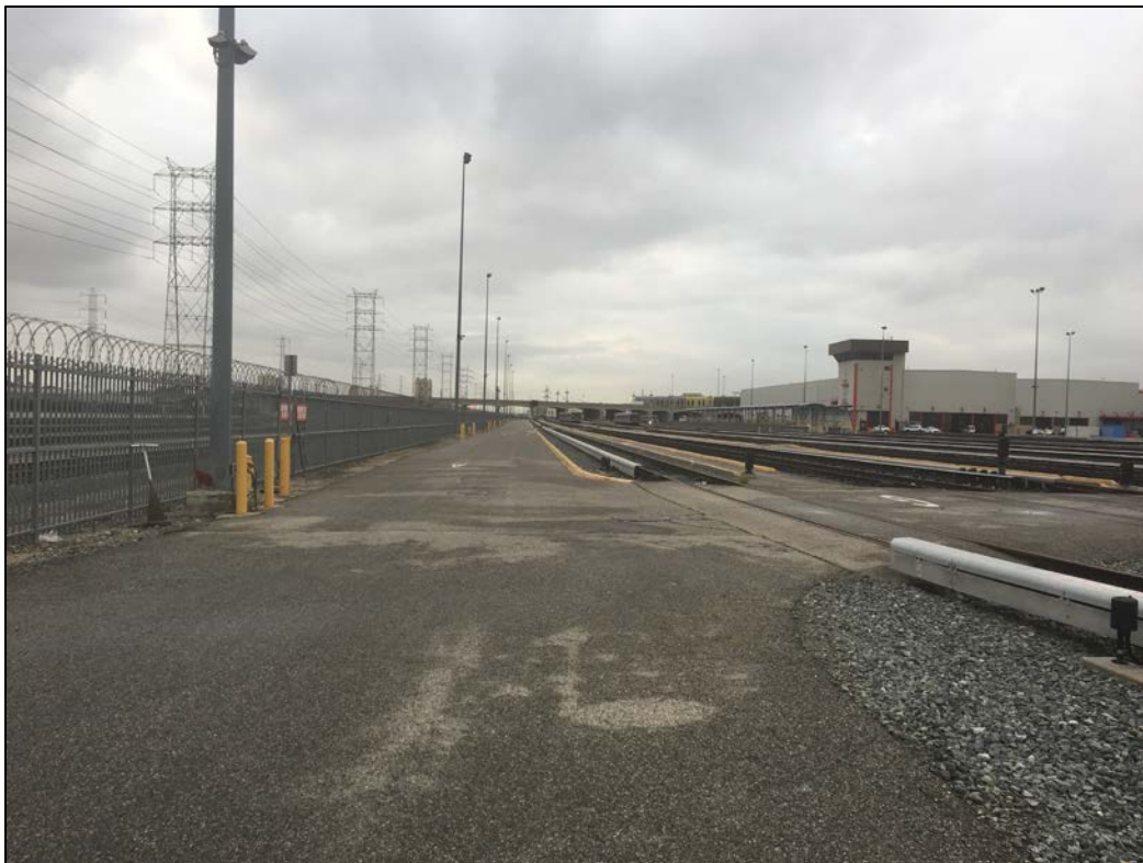
Figure 5. View of Southern Half of Project Area South of 1 st Street Bridge; View Towards South.