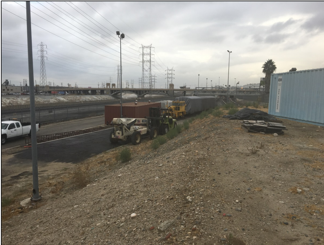
Figure 8. Unpaved Area Near the Northernmost End of the Project Area, View Towards South-Southeast.