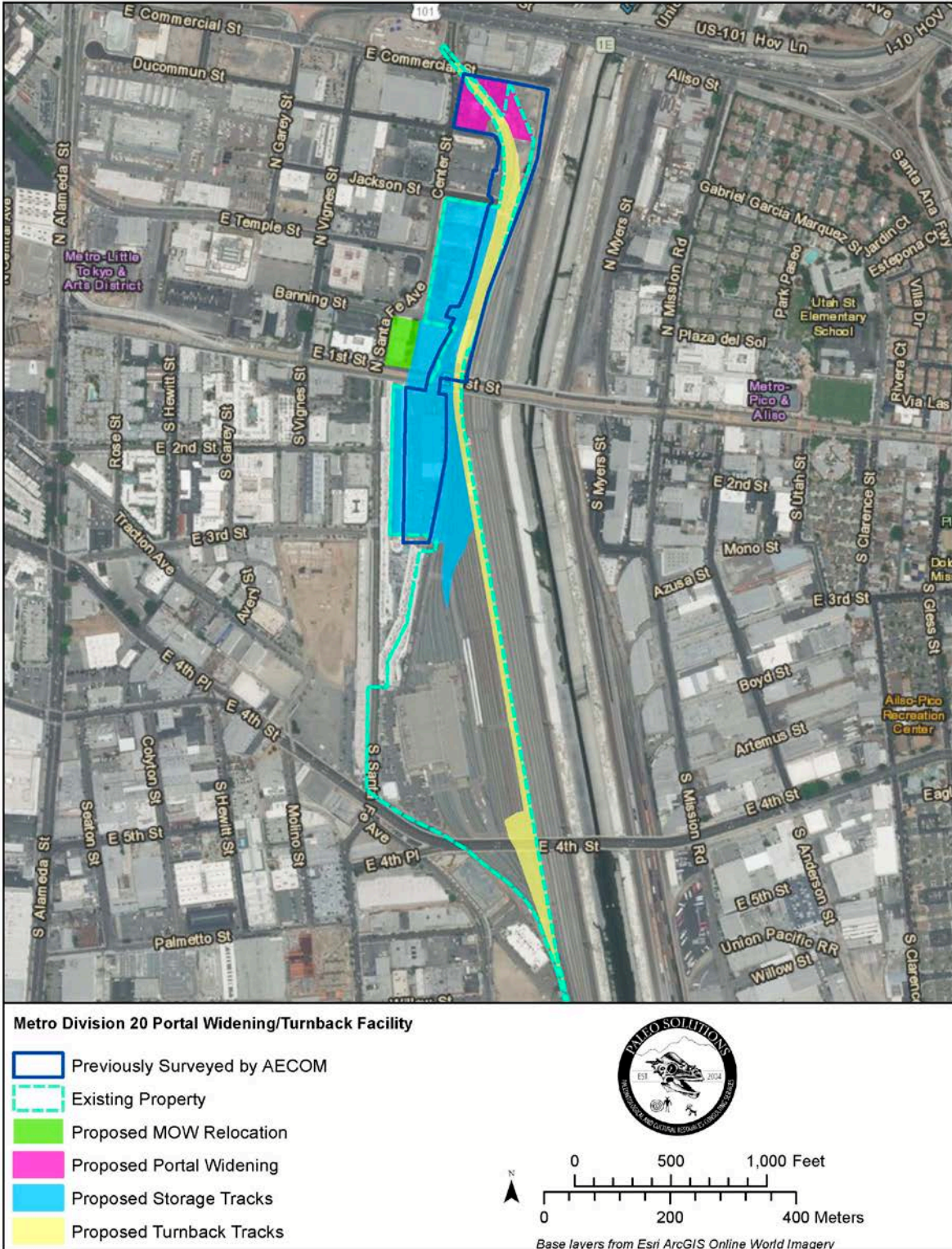
Figure 3. Survey Coverage Map.