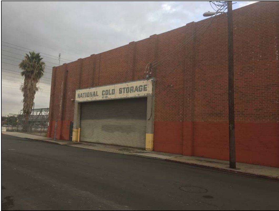
Figure 6. View of Cold Storage Building from Jackson Street; View Towards Southeast.