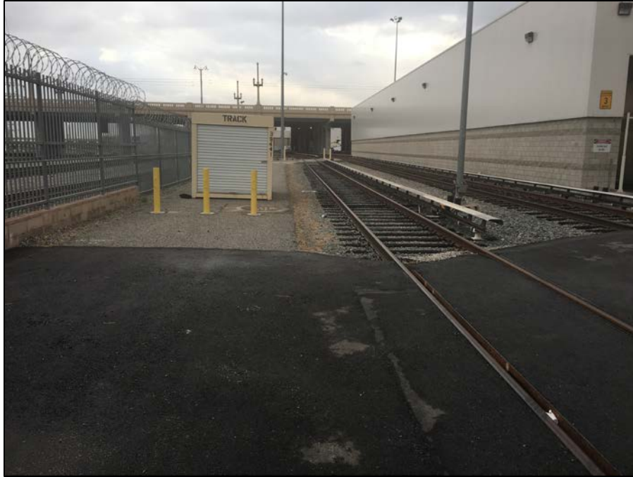
Figure 4. View of Northern Half of Project Area North of 1 st Street Bridge; View Towards South.