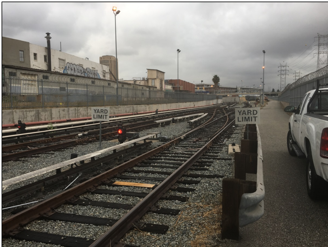
Figure 7. Segment of P-19-186804/P-30-176663 Within the Project Area, North of 1st Street Bridge; View Towards North.