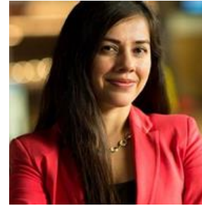
Lucy Delgadillo Highway Programs