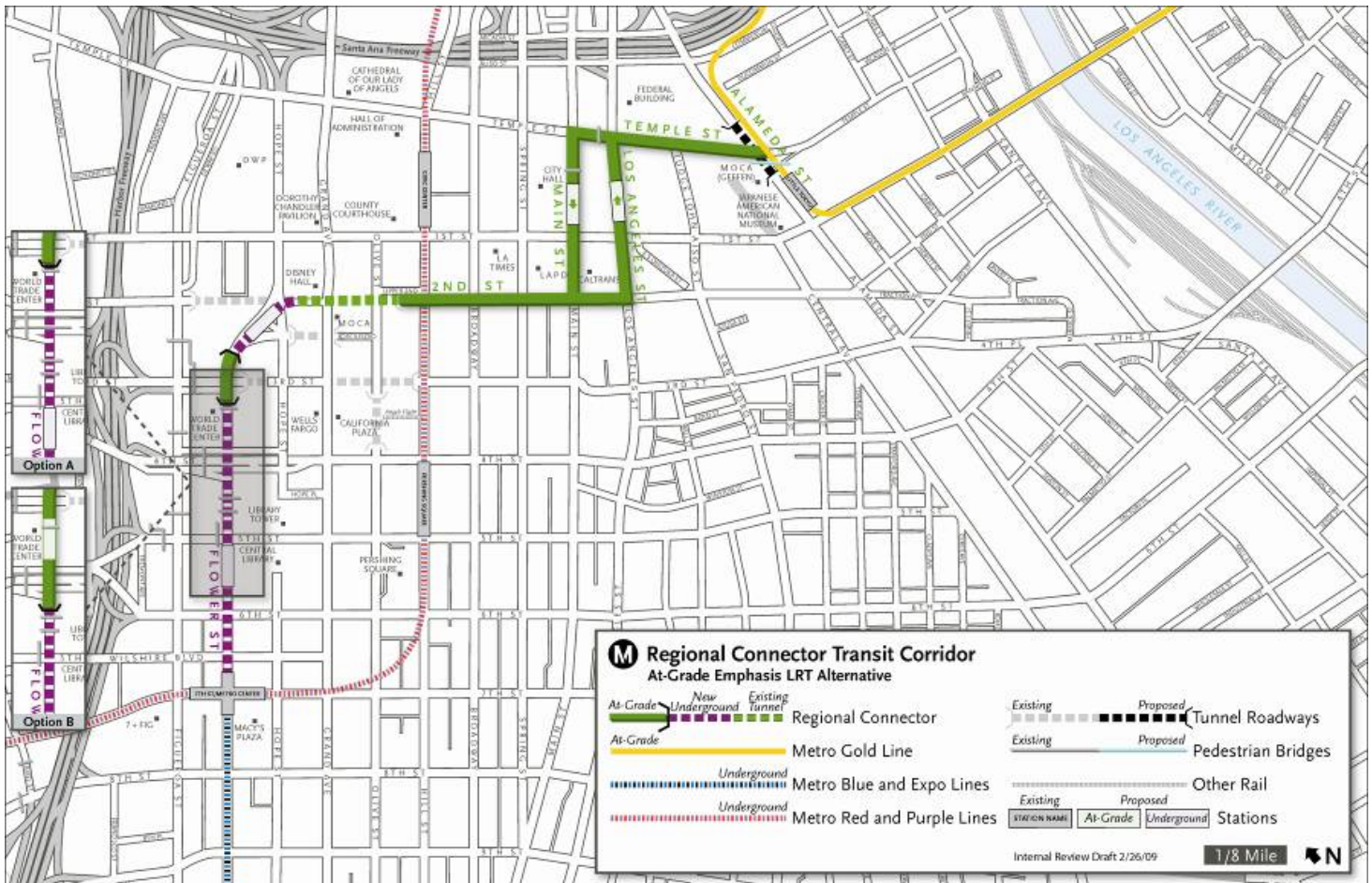
Figure 1: At-grade Emphasis LRT Alternative