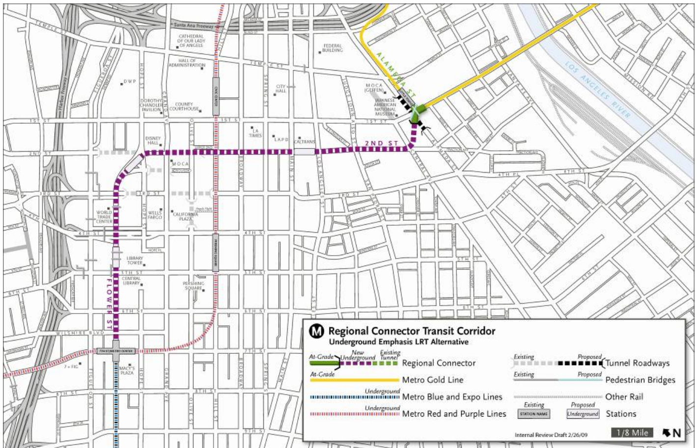
Figure 2: Underground Emphasis LRT Alternative

Station locations for this alternative would all be underground and include the area north of 5 th Street on Flower Street, adjacent to Bunker Hill just south of 2 nd Street and 2 nd Street between Los Angeles and Main Streets.