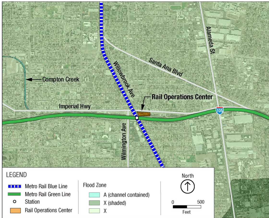
Figure 4-6. FEMA Floodplains in the Vicinity of the Rail Operations Center

Change The following is a modification of and replaces Section 4.5.3.