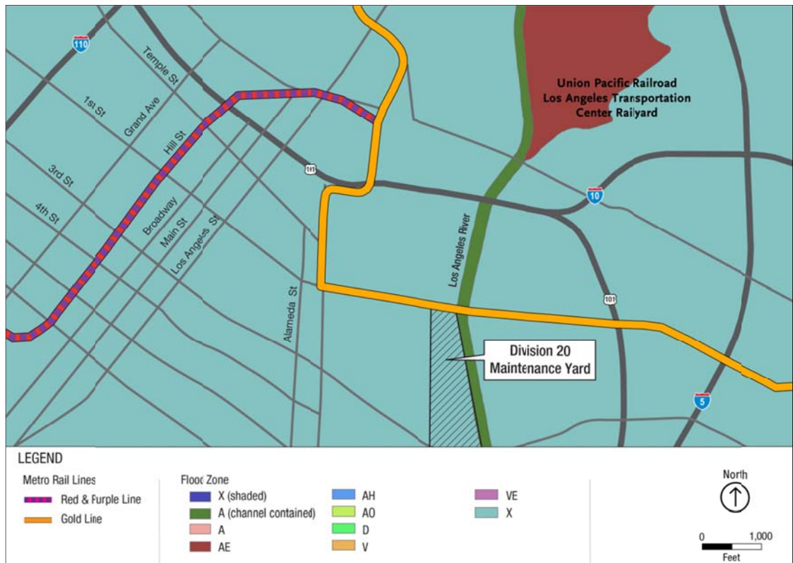
Figure 4-7. FEMA Floodplains in the Vicinity of the Proposed Maintenance Yards