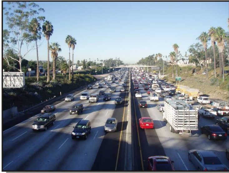
On the I-10 looking west from Crenshaw Boulevard, the commute toward the West Los Angeles area is particularly congested during the AM Peak Period.