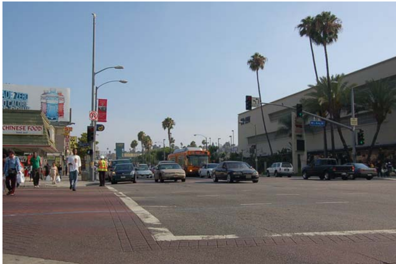
Figure 3-8. Pedestrian Activity at the Intersection of Crenshaw and Martin Luther King, Jr. Boulevards

The pedestrian system varies across the study area depending on the density, mix of land uses, and vehicular circulation patterns. The entire street network, excluding the urban freeways, is generally considered open to pedestrian traffic, either on the sidewalks or road shoulders. Figure 3-8 shows pedestrians crossing at an enhanced pedestrian