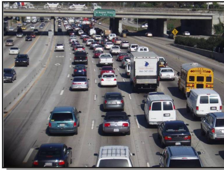
During the AM Peak Period, the commute northbound on the I-405 towards the West Los Angeles area, is more congested than the southbound commute.

Source: Terry A. Hayes Associates LLC, 2007