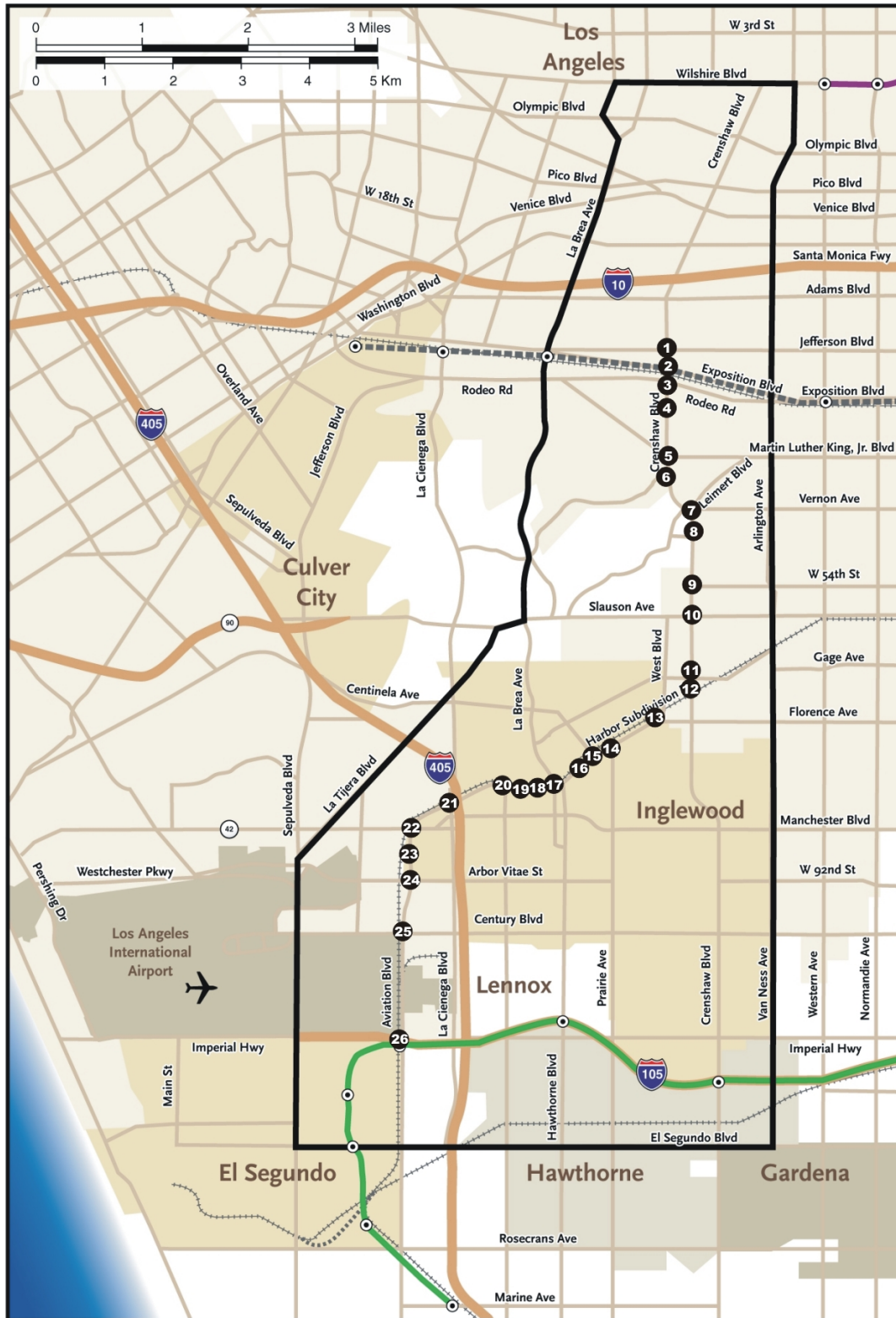
Figure 3-4. Analyzed Intersections Affected by the LPA