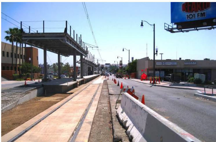
Figure 3-11. At-Grade LRT Construction

This section examines the potential for impacts during the construction period of the LPA. Implementation of the No-Build Alternative would not result in disruption to the