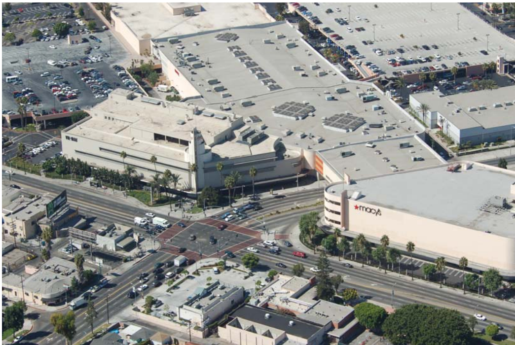
Figure 3-6. Baldwin Hills Crenshaw Plaza and Off-Street Parking