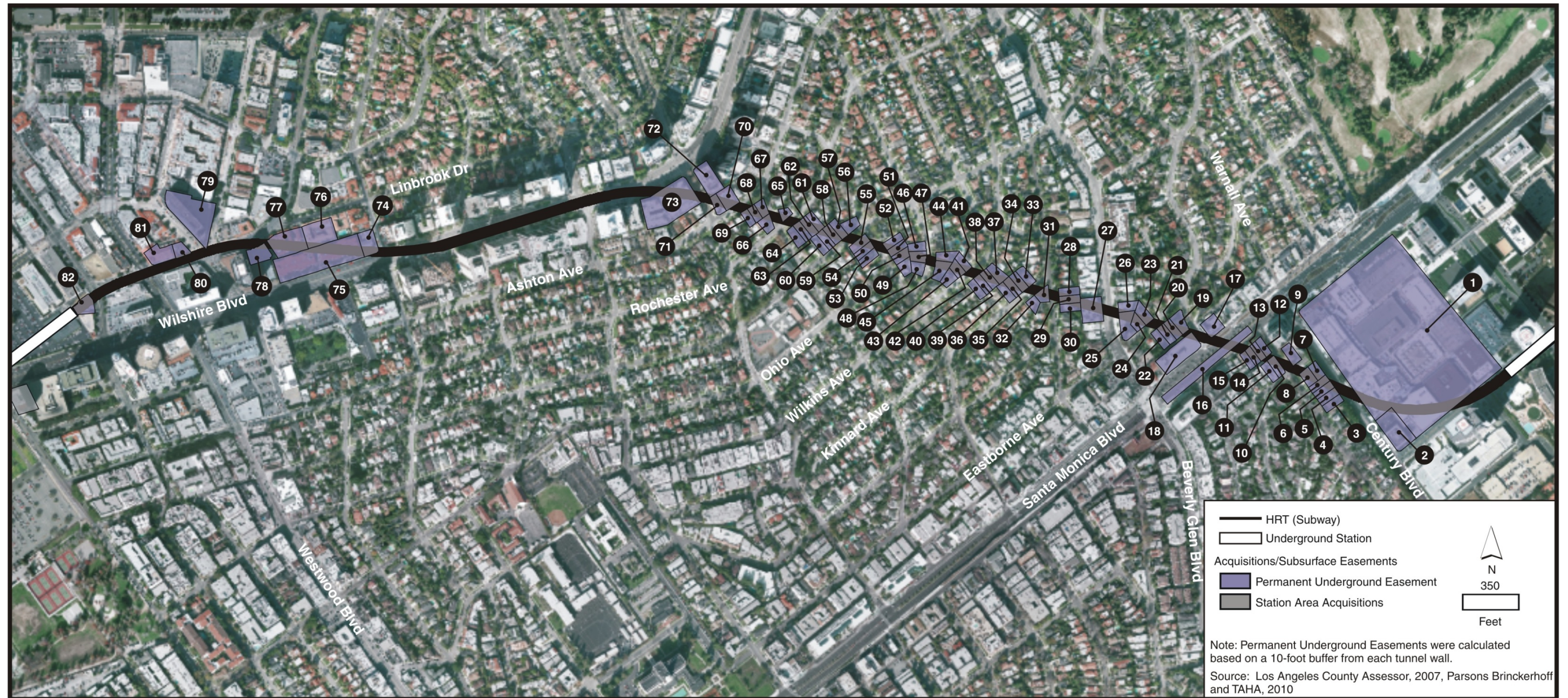
Figure 5-3: Segment Option 4P: Permanent Underground Easements