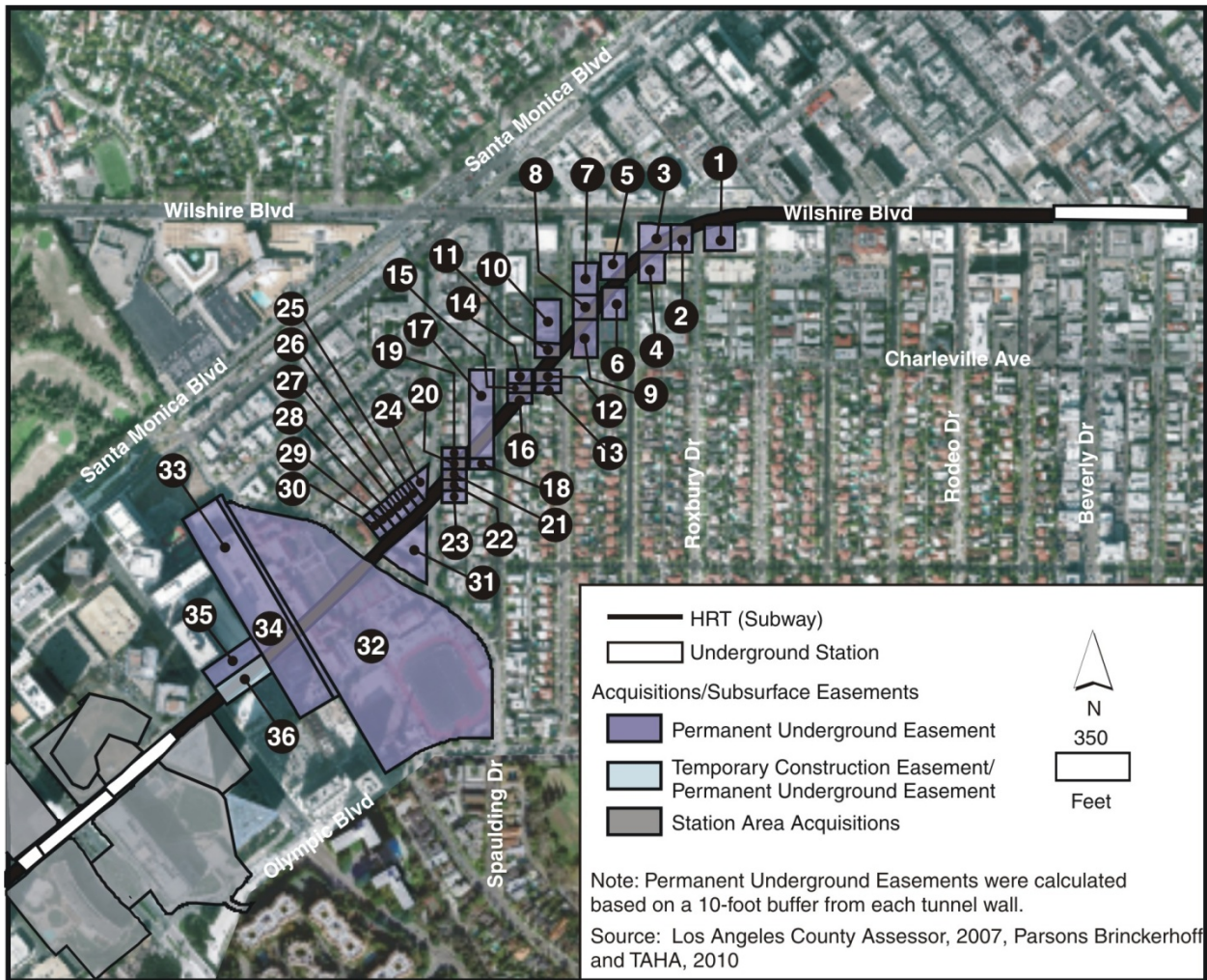
Figure 4-2: Segment Option 4G: Permanent Underground Easements