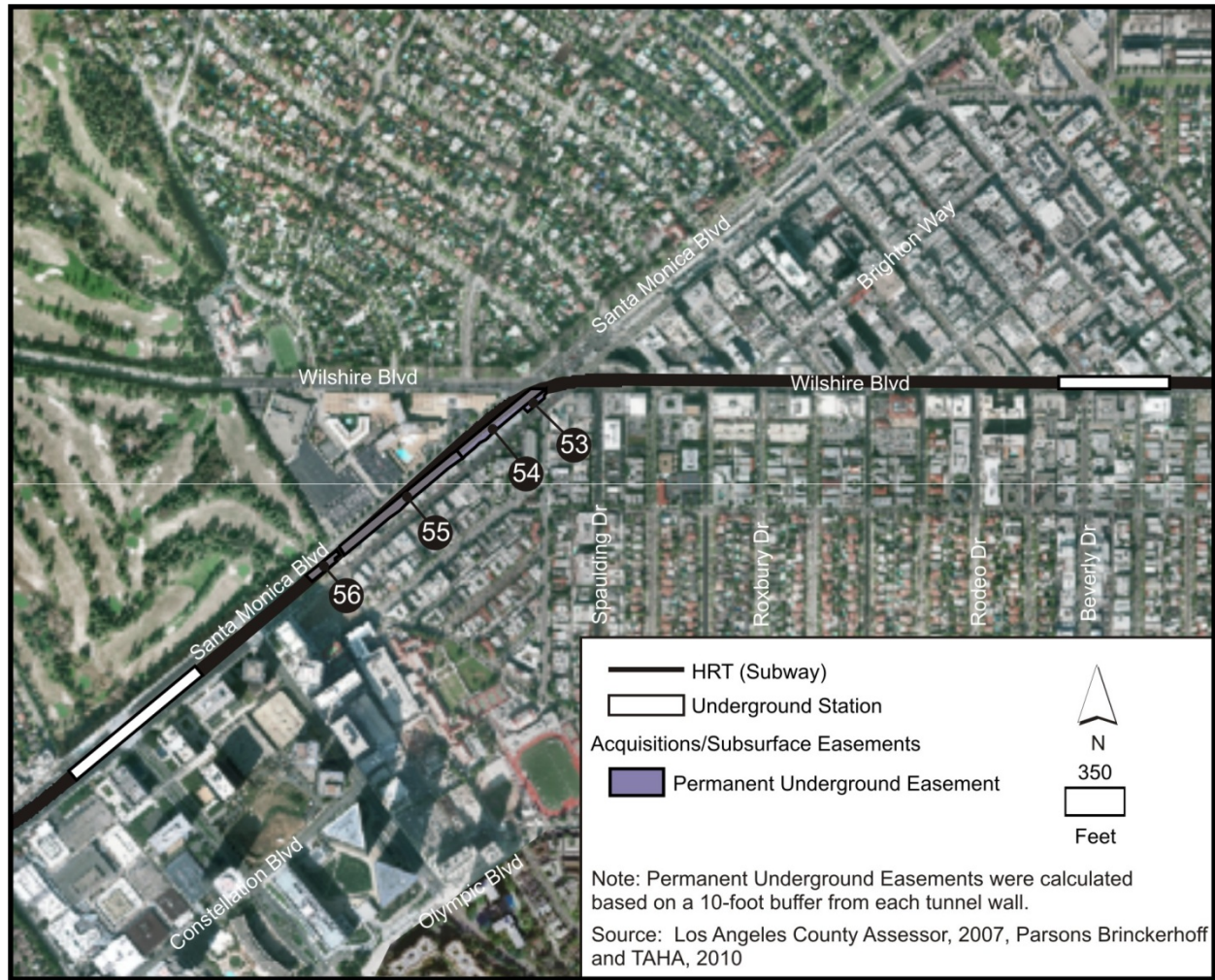
Figure 4-1: Segment Option 4I: Permanent Underground Easements