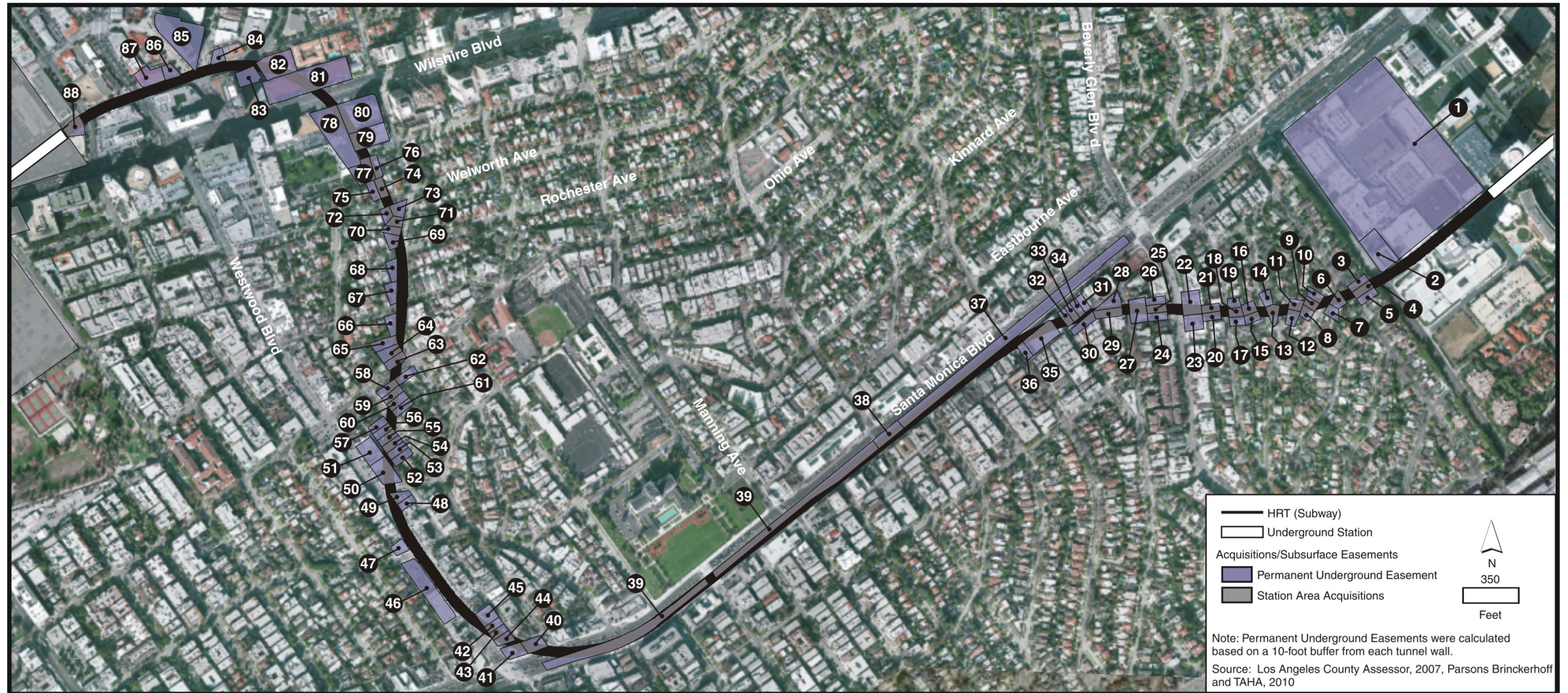
Figure 5-11: Segment Option 4T: Permanent Underground Easements