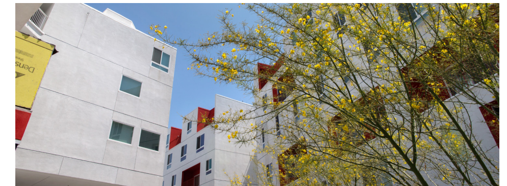
ONE SANTA FE