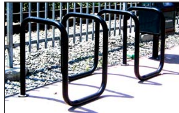
Item 2: Multi-U rack