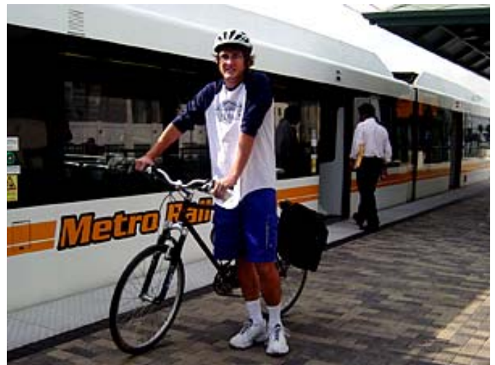
Bikes on Rail