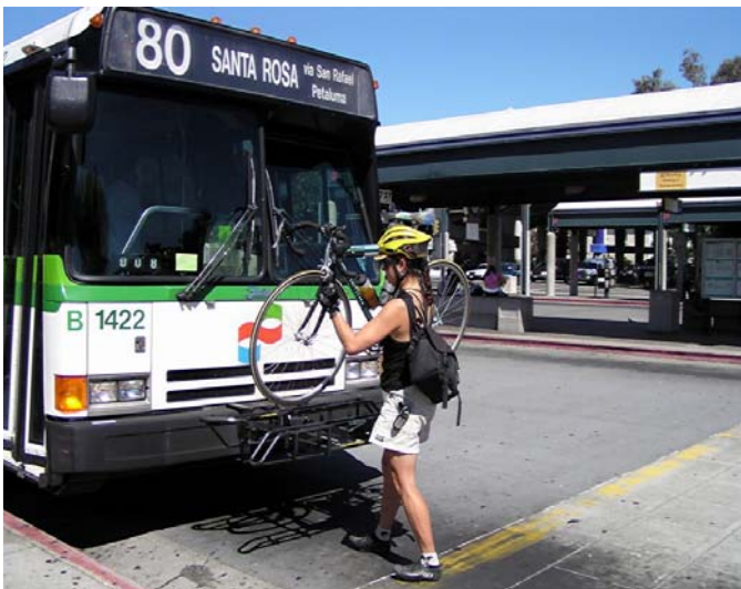
Bikes on Buses

Studies show that effective public transit depends on people being able to walk or bicycle comfortably and safely to and from stations and stops, reducing some demand for car parking and the impacts of short trips on air quality. Encouraging bike-transit use also provides more mobility options and contributes to better health.