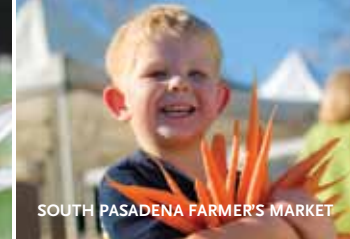
SOUTH PASADENA FARMER'S MARKET