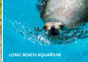
LONG BEACH AQUARIUM