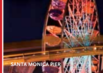
SANTA MONICA PIER