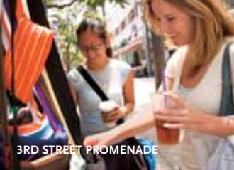
3RD STREET PROMENADE