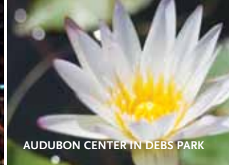
AUDUBON CENTER IN DEBS PARK