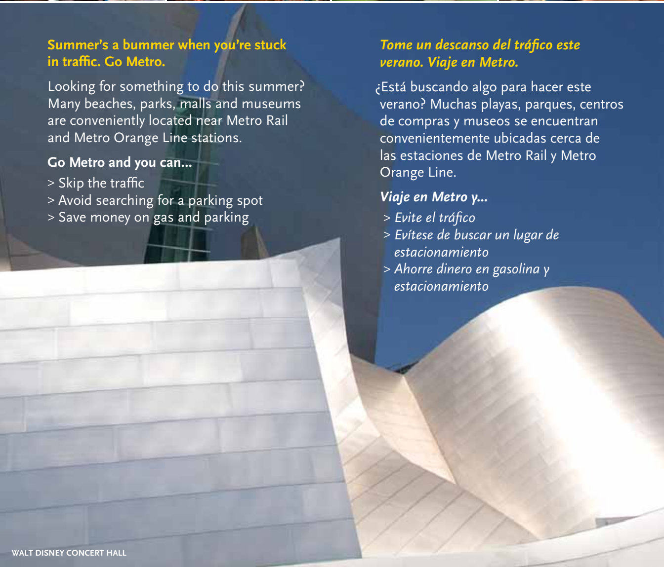
WALT DISNEY CONCERT HALL