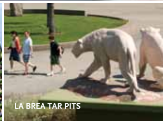
LA BREA TAR PITS