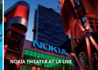
NOKIA THEATER AT LA LIVE