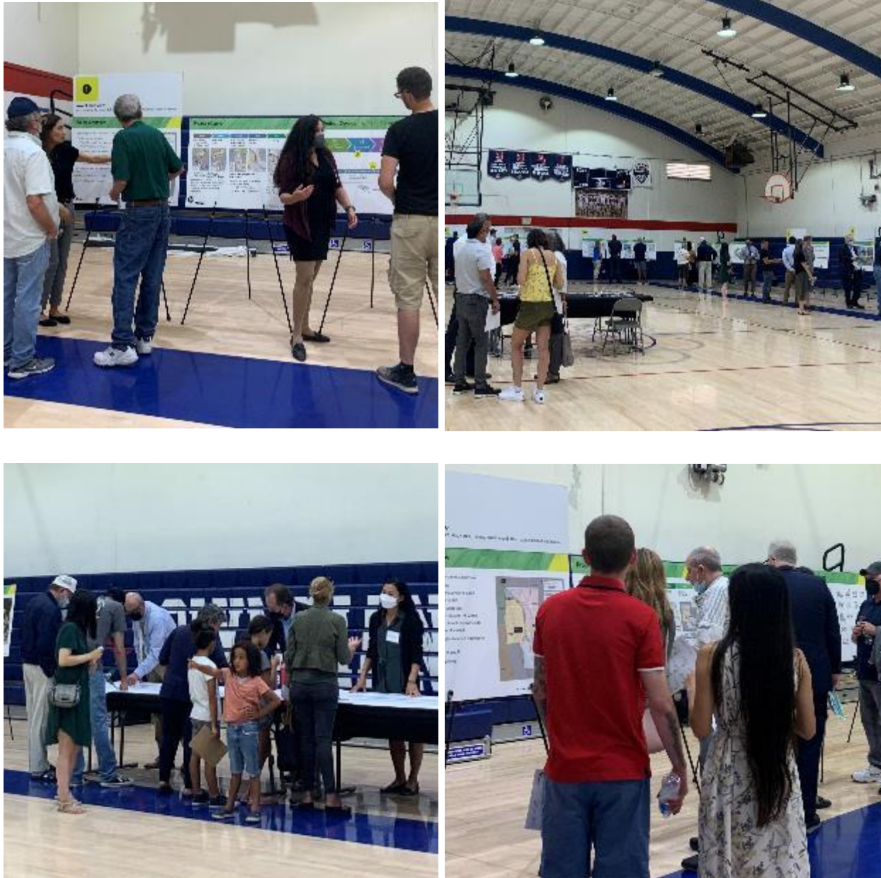
Figure 4. Lawndale Community Open House Meeting