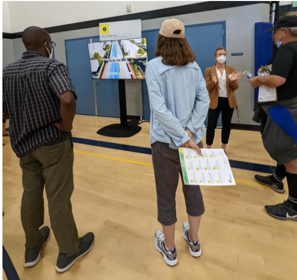
Figure 2. Redondo Beach Community Open House Meeting

After the presentation, the project team members responded to approximately 180 questions. Spanish language translation was available.