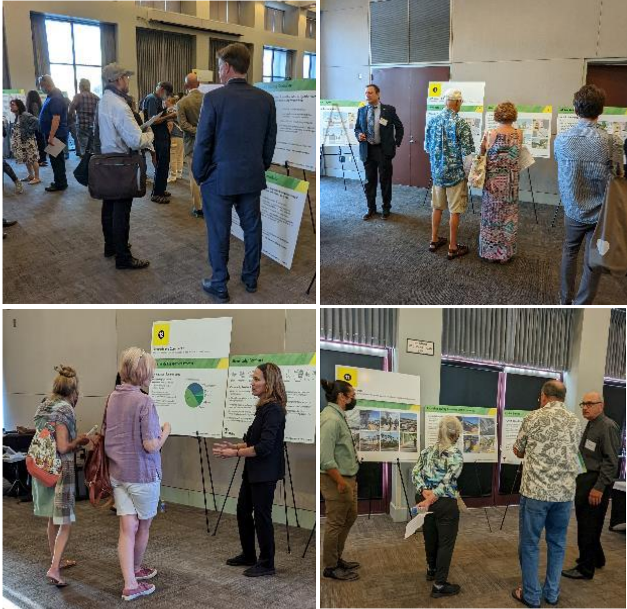
Figure 3. Torrance Community Open House Meeting