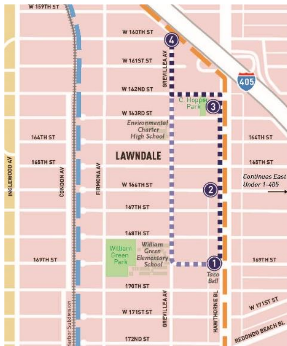
Hawthorne Blvd (North) Walk Route 2