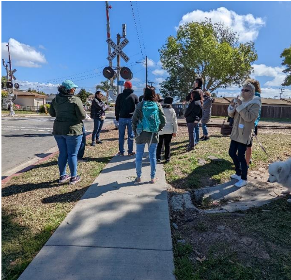
Condon Ave/ Metro ROW Walk (Walk 1)