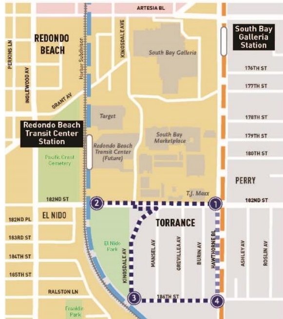
Hawthorne Blvd/ Metro ROW (South) Walk Route 4