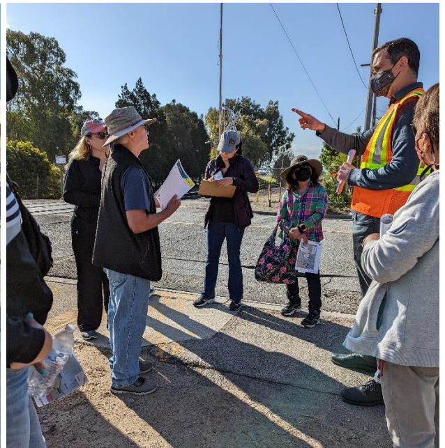
Metro ROW/Hawthorne Blvd (South) Walk (Walk 4)