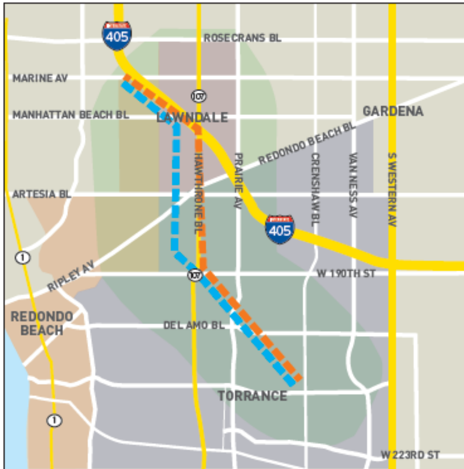
Figure 1. Flyer Distribution Map: One-Mile Radius