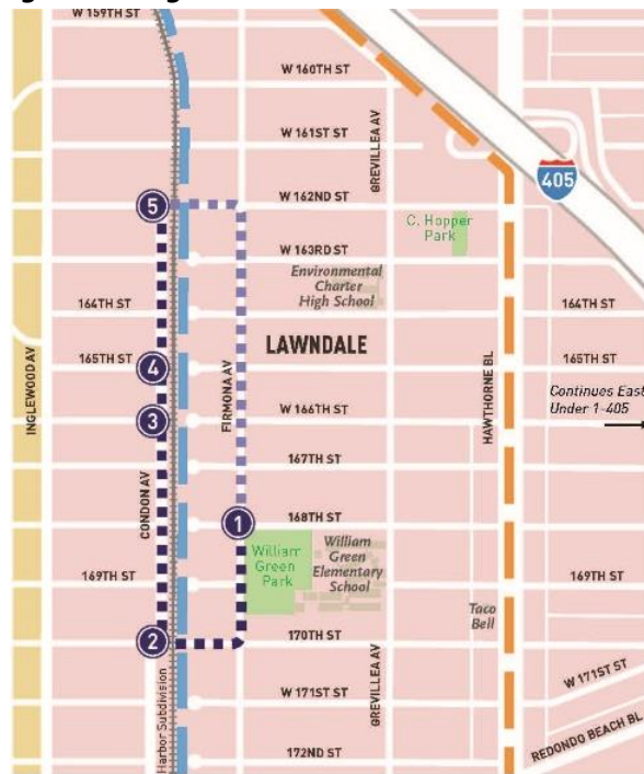
Condon Ave/ Metro ROW Walk Route 1