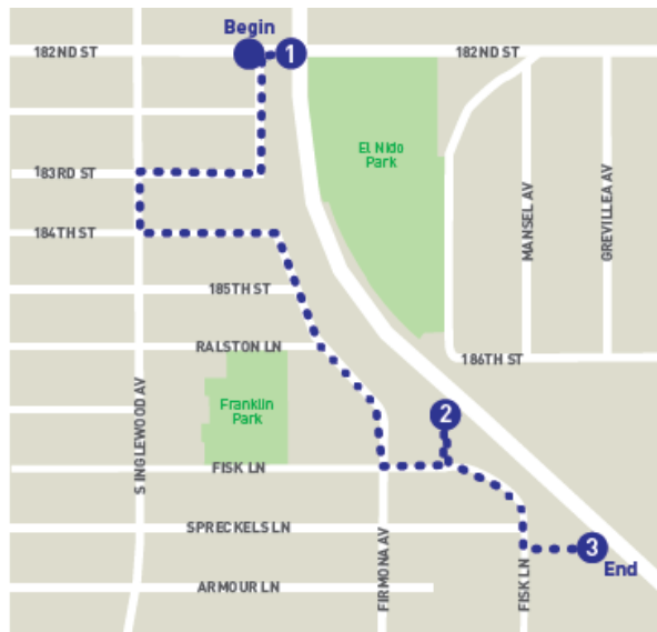
South of 182 St/ Metro ROW & Firmona Ave (Additional Walk)