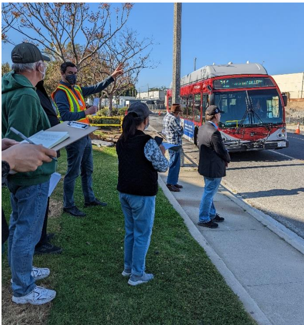
South Bay Galleria Walk (Walk 3)