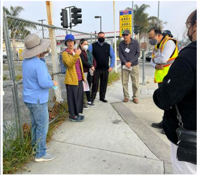
Hawthorne Blvd (North) Walk (Walk 2)