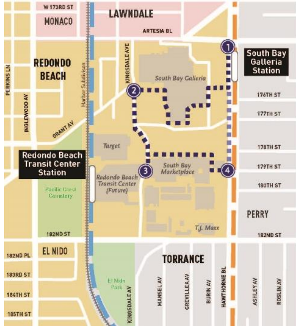
South Bay Galleria Walk Route 3