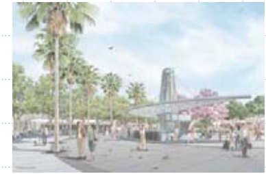
1 st /Soto