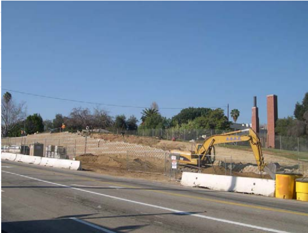
Construction of the retaining wall at widened portion of 1 st Street