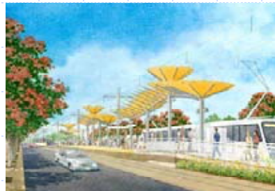
East Los Angeles Civic Center