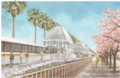
Little Tokyo/Arts District