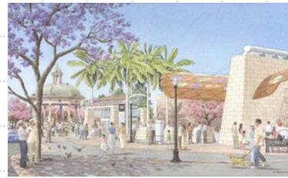
Boyle Heights/ Mariachi Plaza